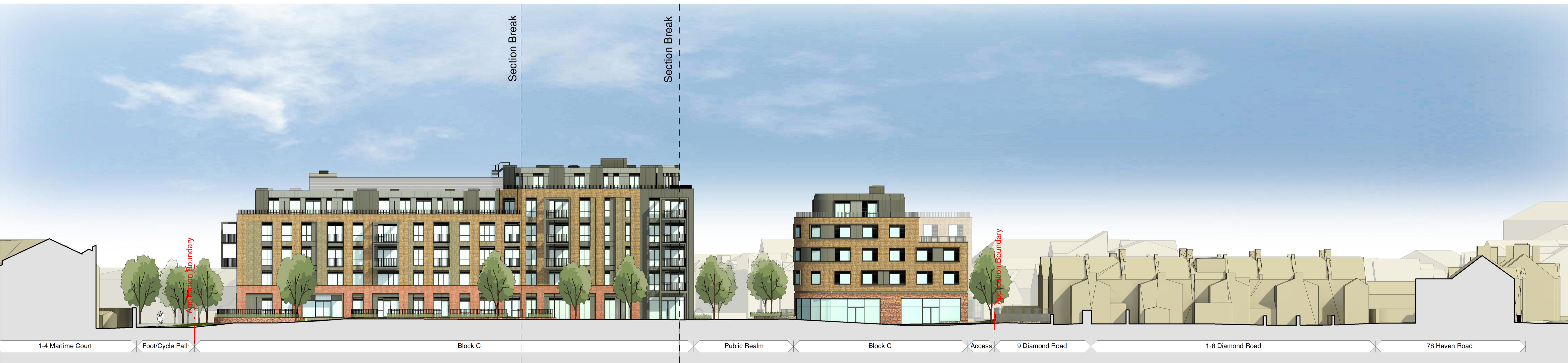
Street Elevation 6