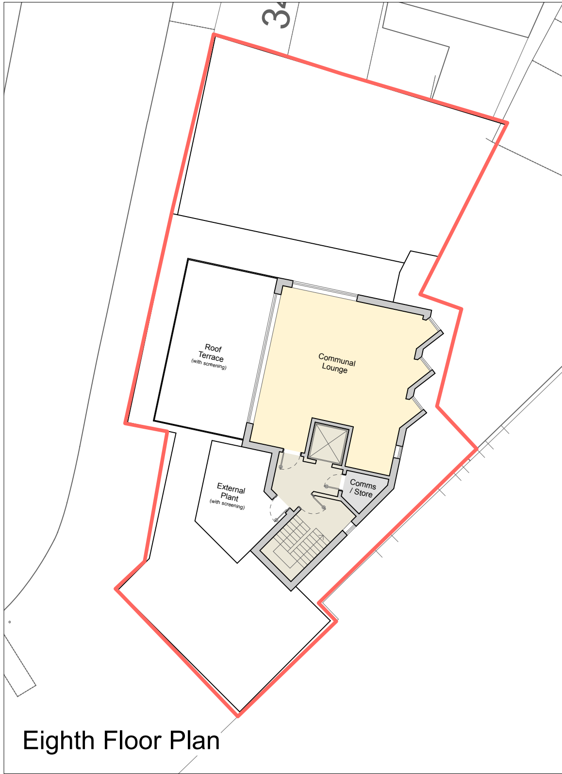
Schedule of Accommodation