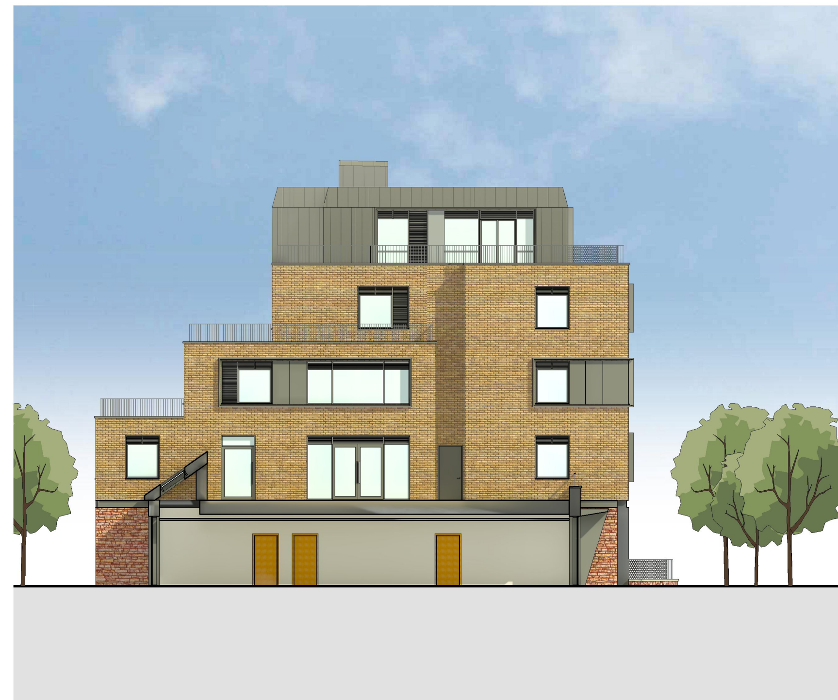
South West Elevation 3 1 : 150