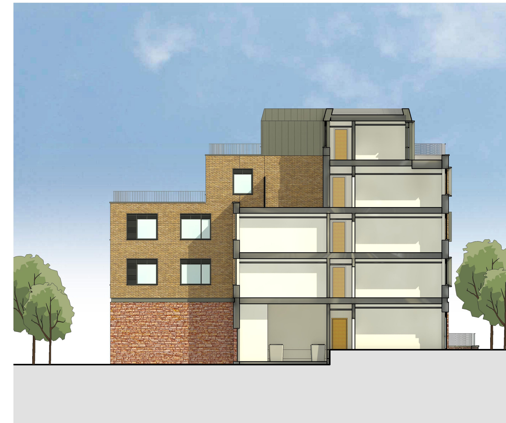
South West Elevation 4 1 : 150