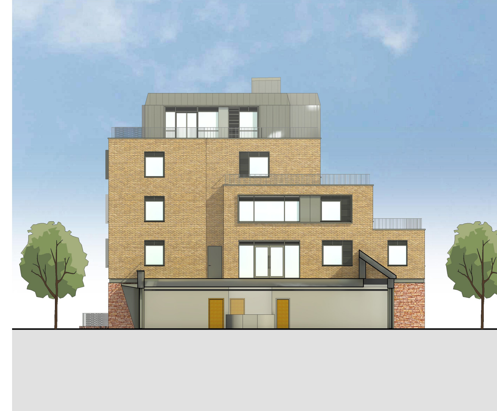
North East Elevation 3 1 : 150