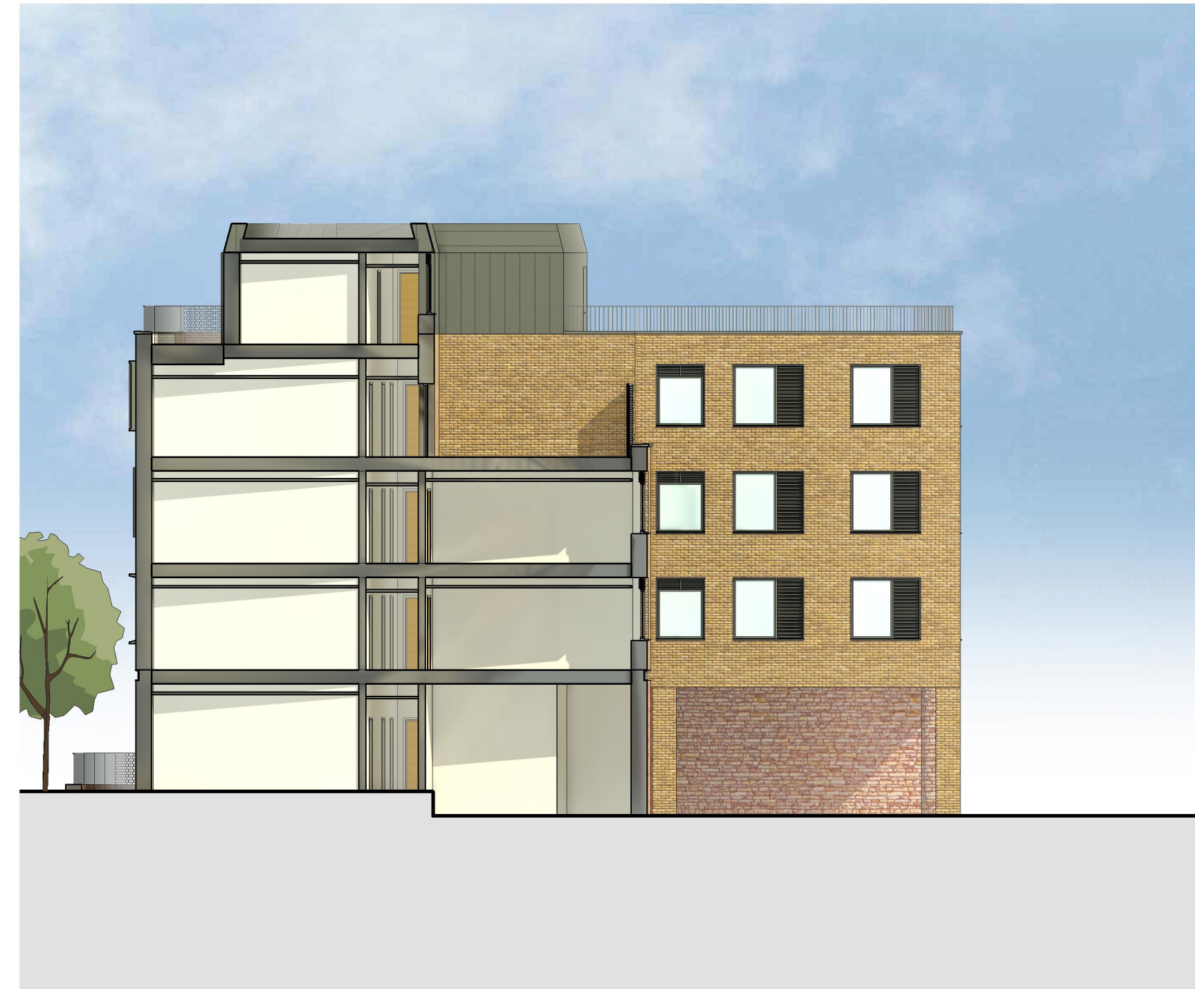
North East Elevation 2 1 : 150