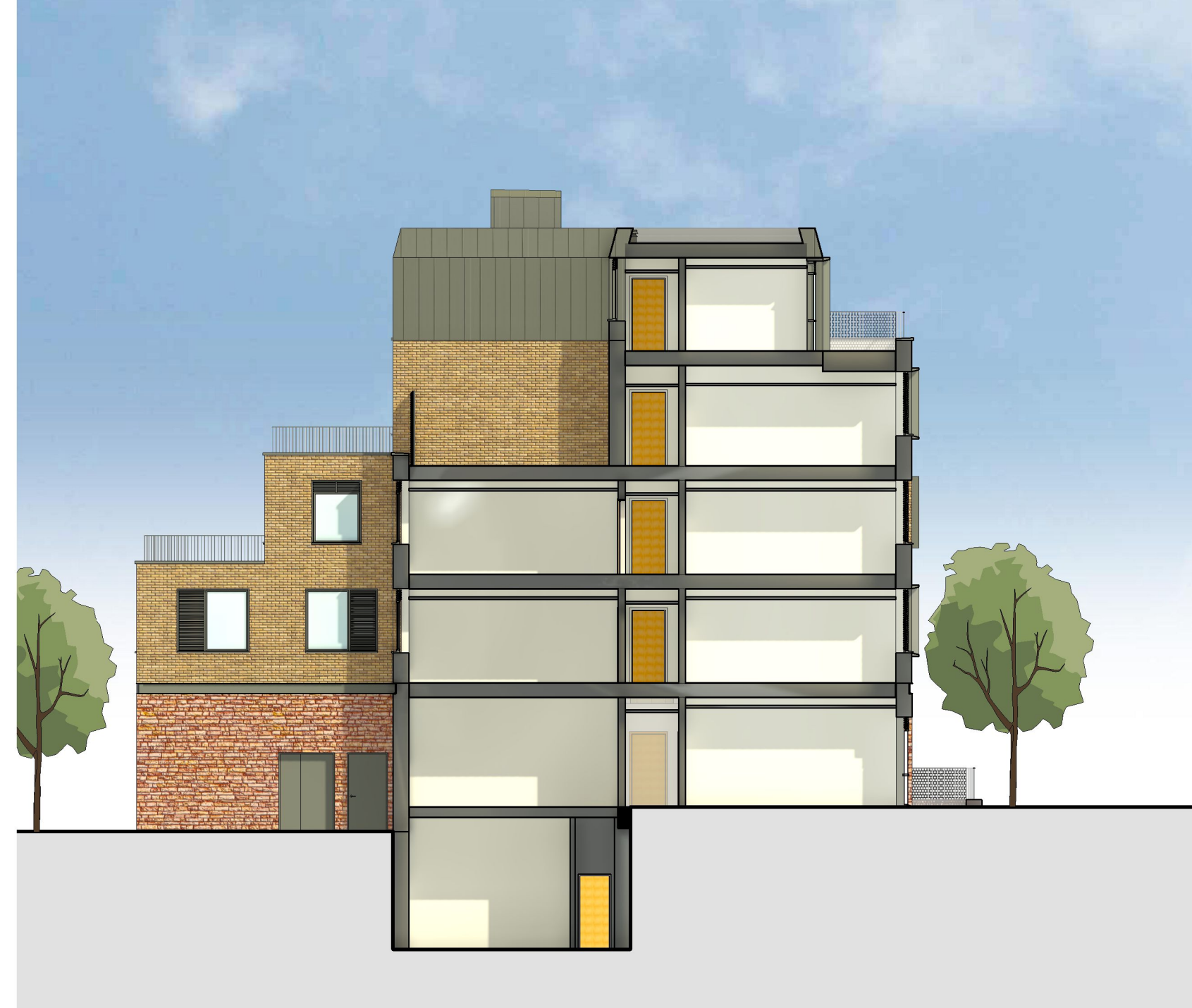
South West Elevation 2 1 : 150