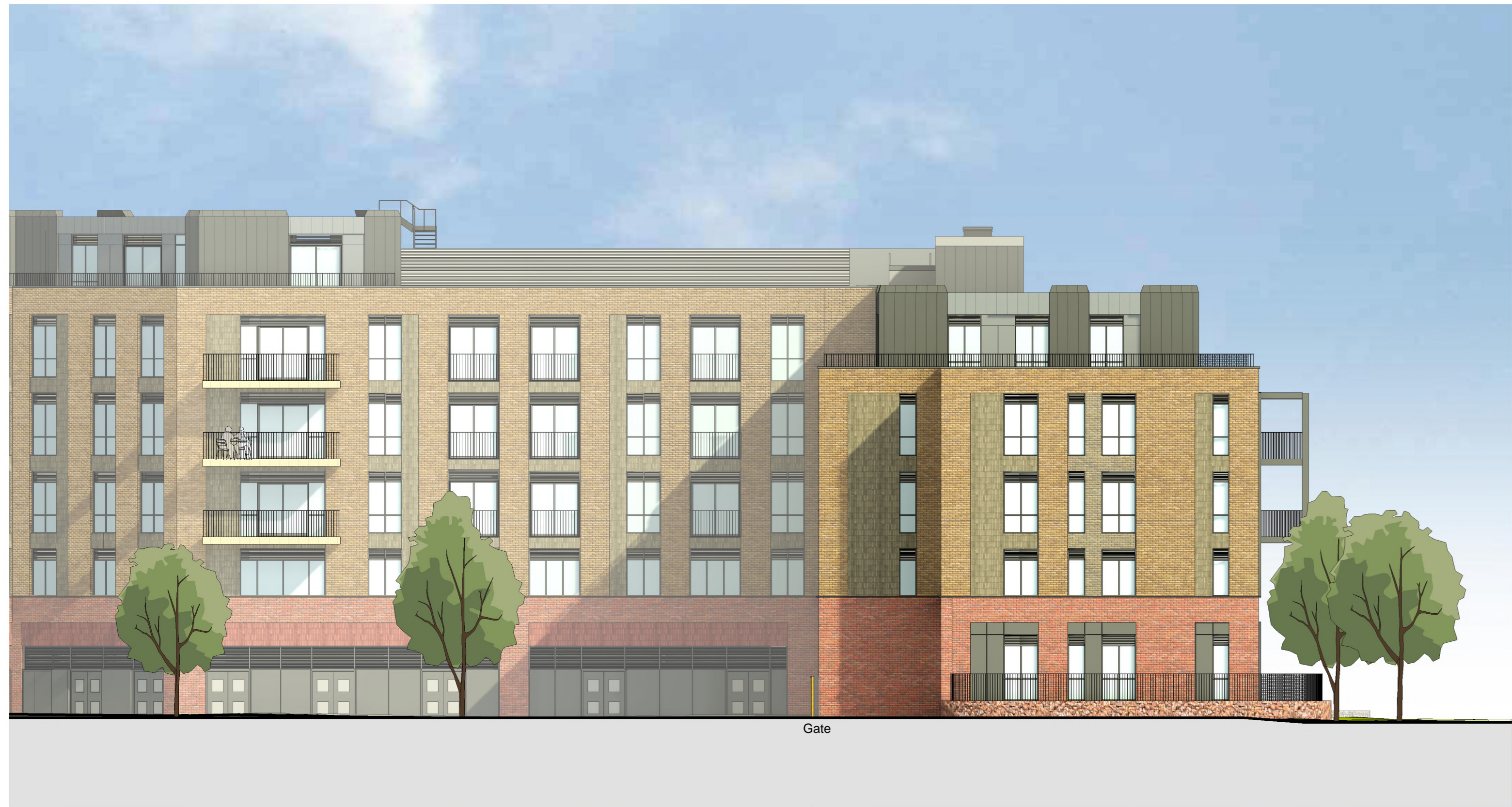
Block C-South East Elevation