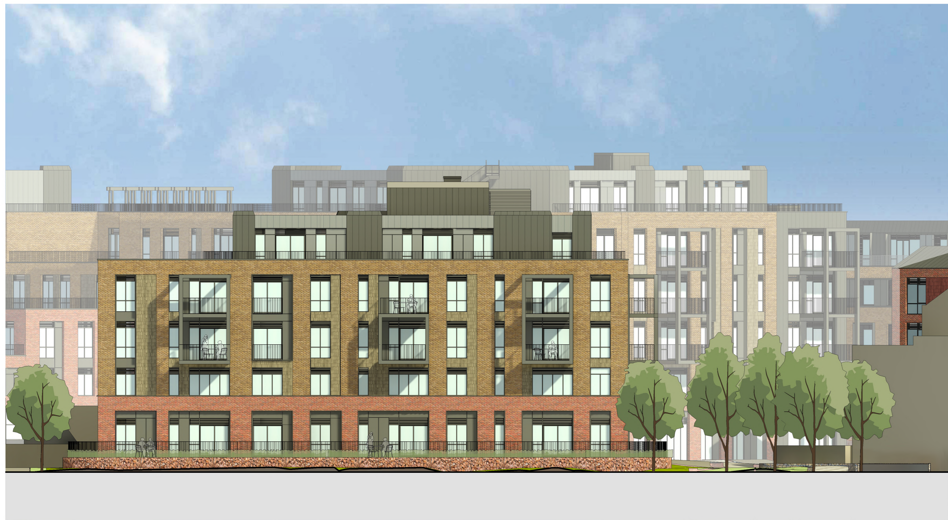
Block C-East Elevation