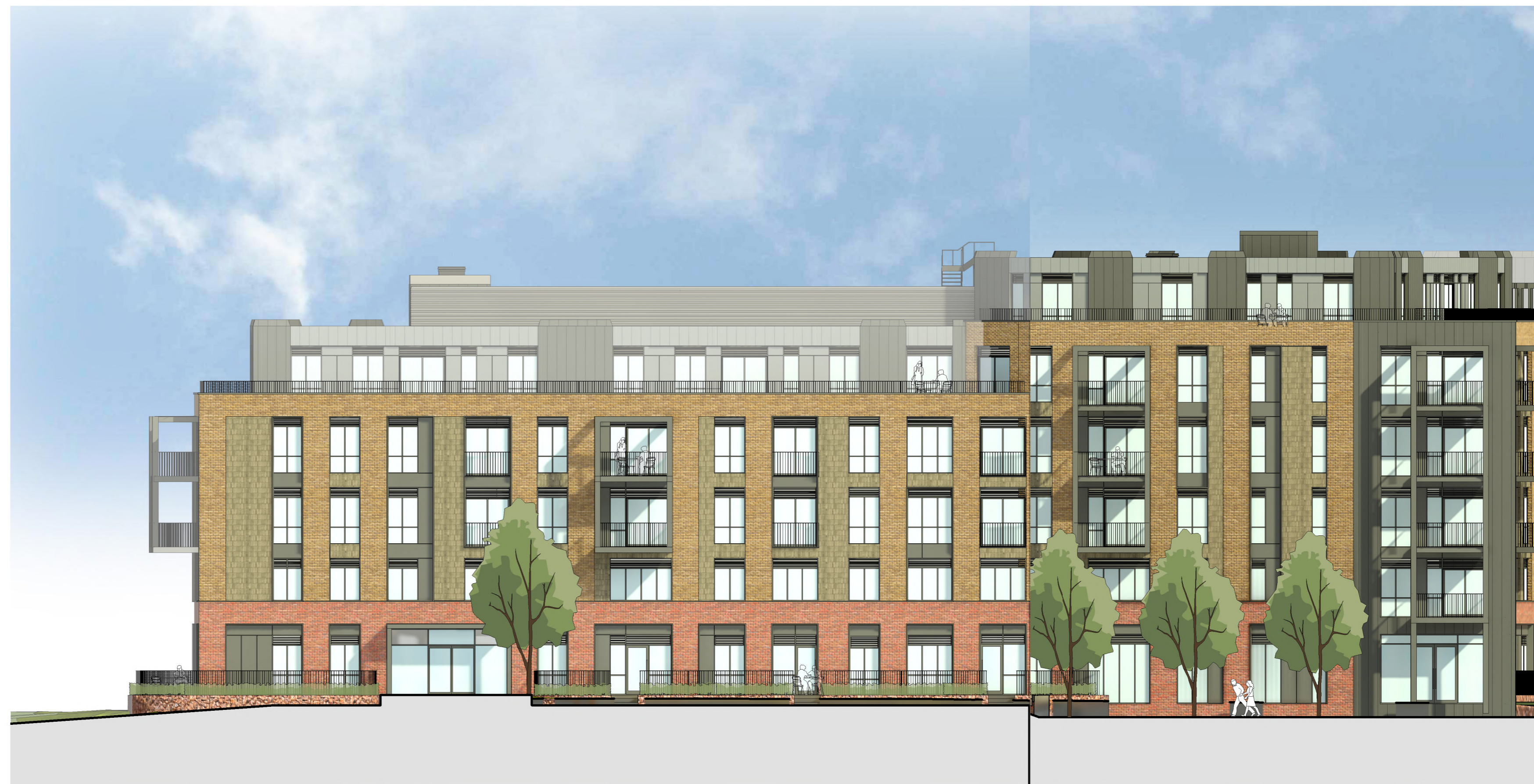
Block C - North East Elevation