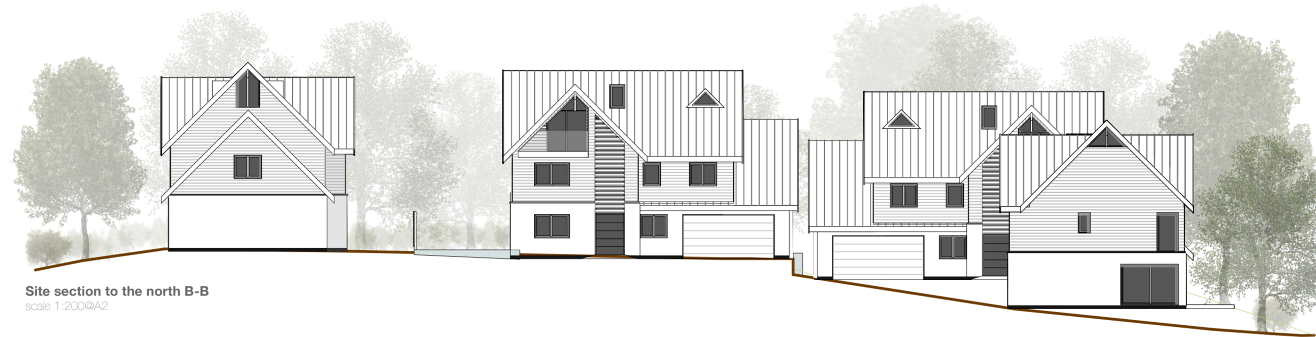
Site section to the north B-B scale 1:200@A2