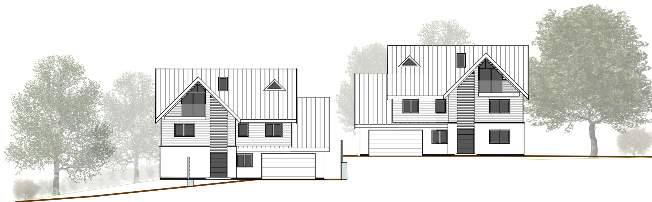
Site section to the south C-C scale 1:200@A2