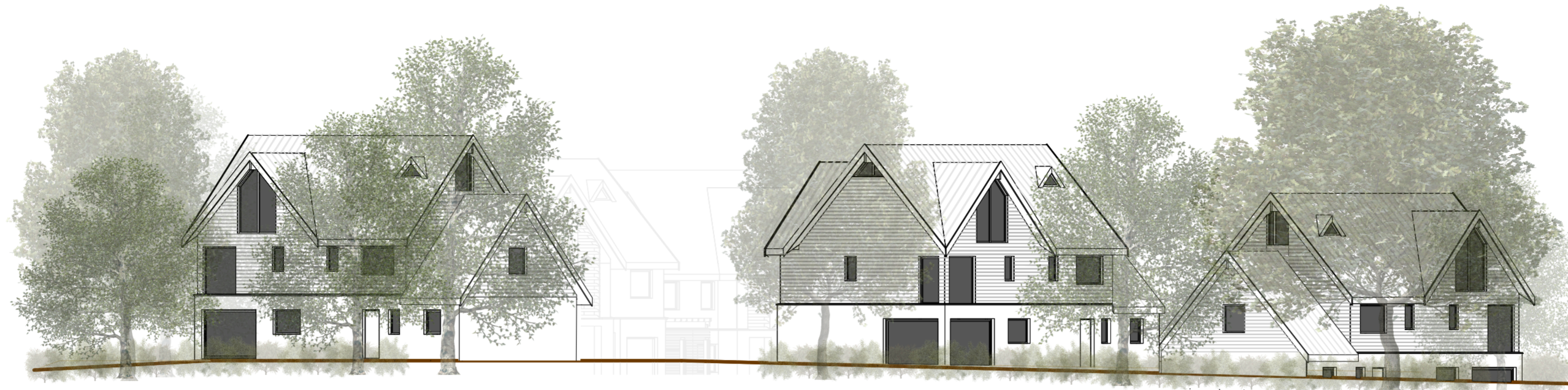
Site section Redhills Road A-A scale 1:200@A2