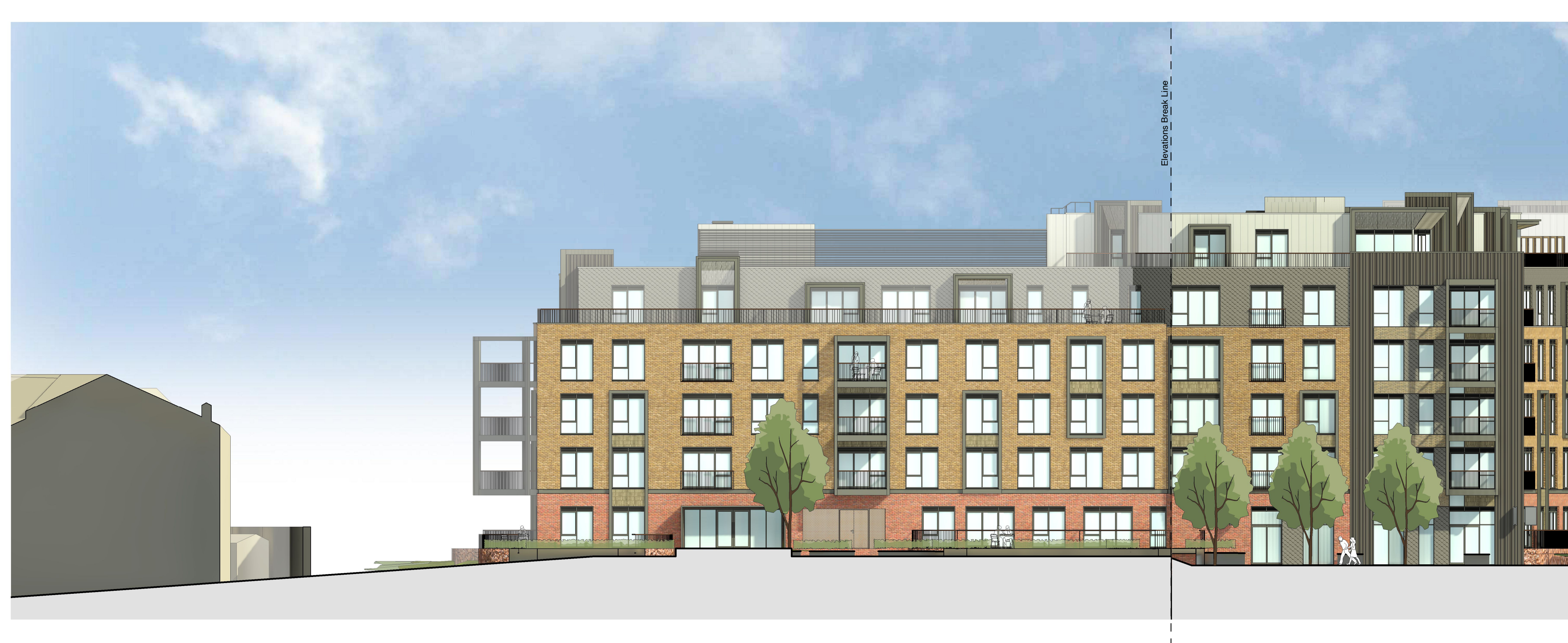
Block C - North East Elevation 1

reported to Piper Whitlock Architecture before commencing work.