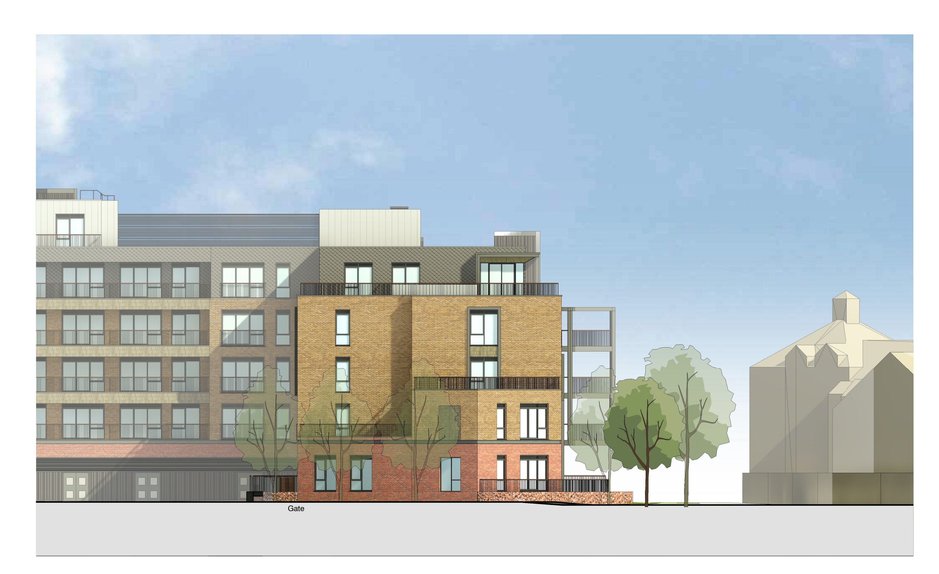
Block C-South West Elevation 2

reported to Piper Whitlock Architecture before commencing work.