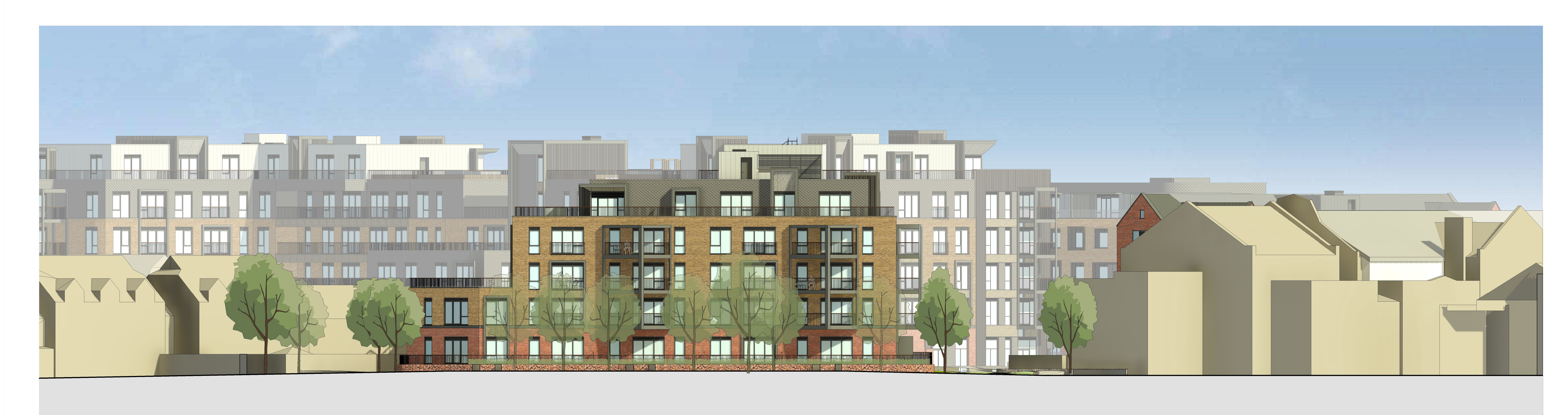
Block C-South East Elevation 2