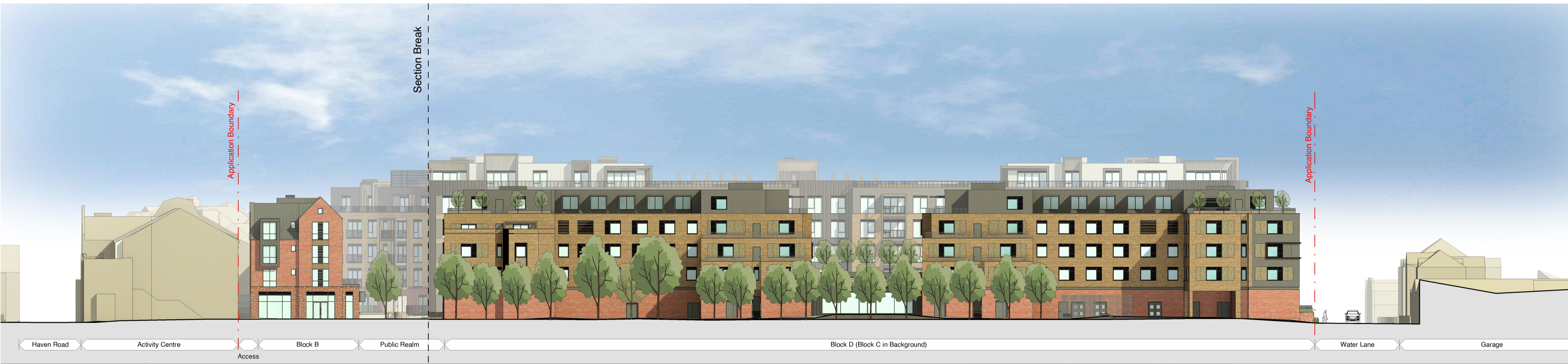
Street Elevation 5