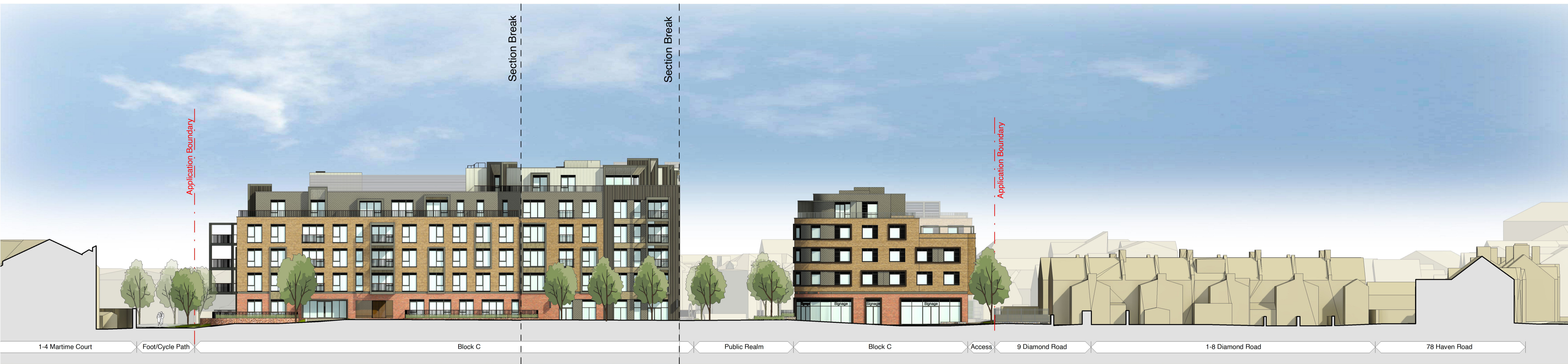
Street Elevation 6