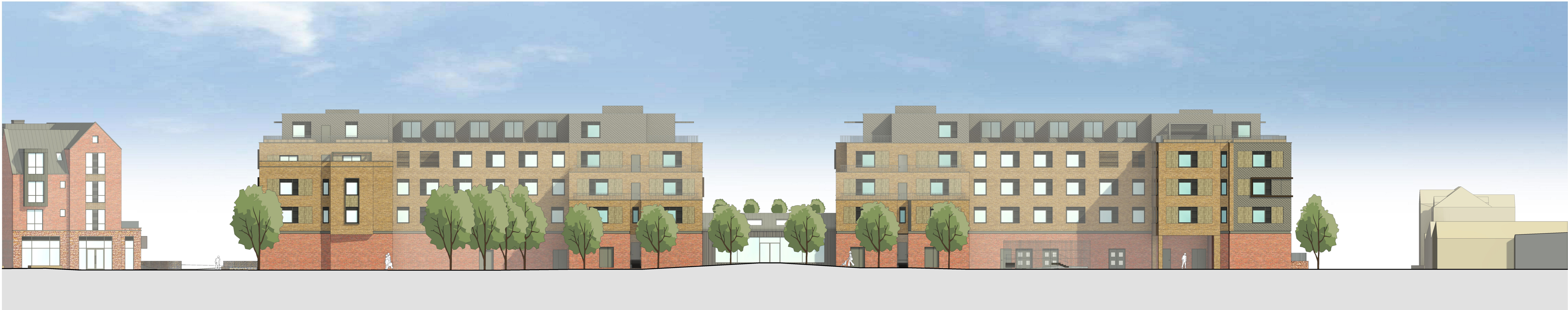
Block D - North West Elevation