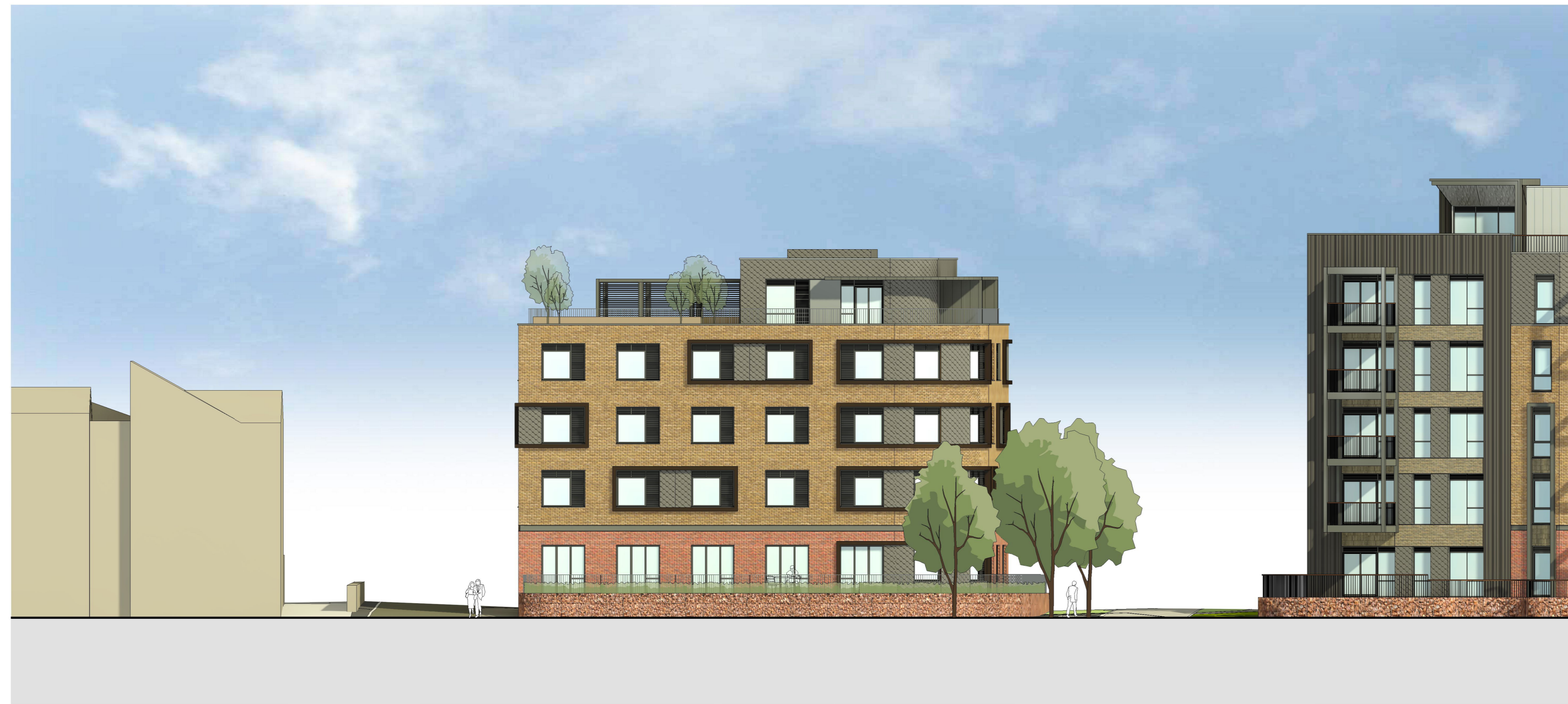
Block D - South West Elevation