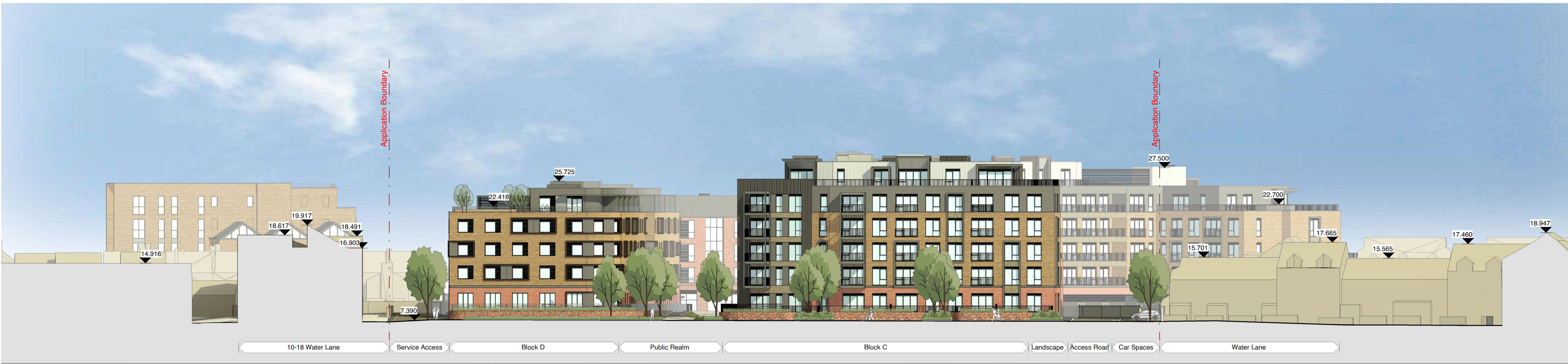
Street Elevation 1