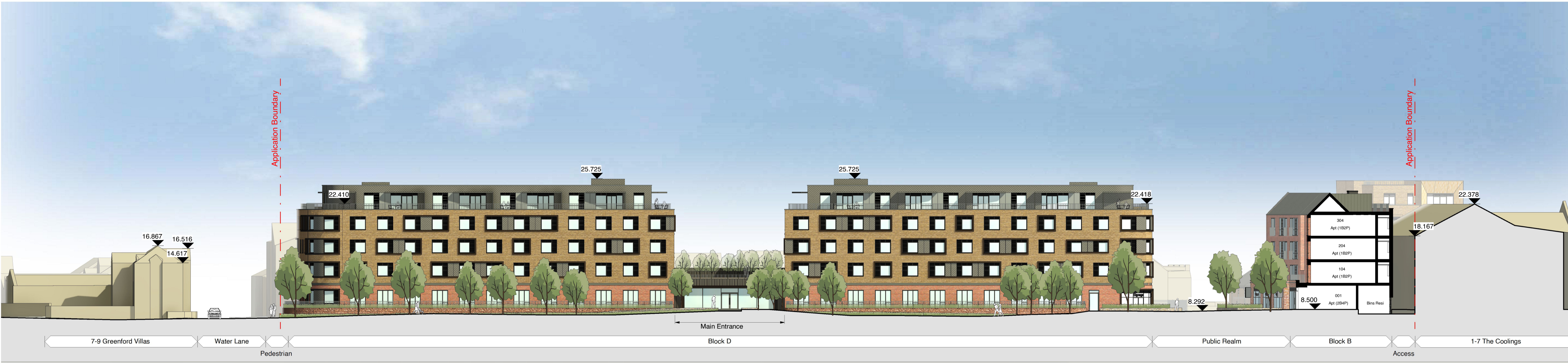
Street Elevation 2