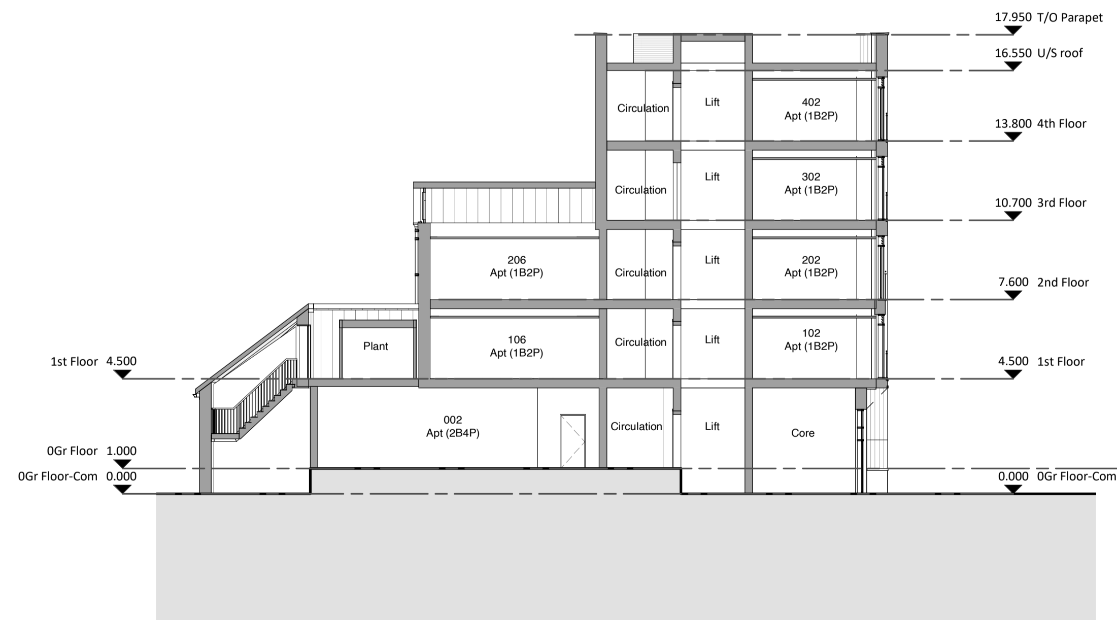
Block A - Section B-B 1 : 150