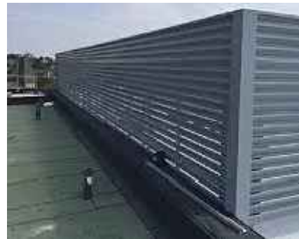
24 - Louvred Plant Screen Colour: Light Grey