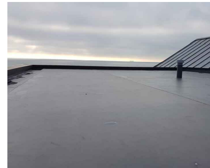
25 - Flat Roofs - Single Ply Membrane Colour: Light, Mid & Dark Grey