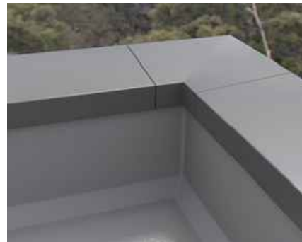
23 - PPC Aluminum Coping and Flashing Details Colour: Dark & Light Grey