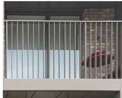
22 - Metal Balustrade Colour: Light & Dark Grey