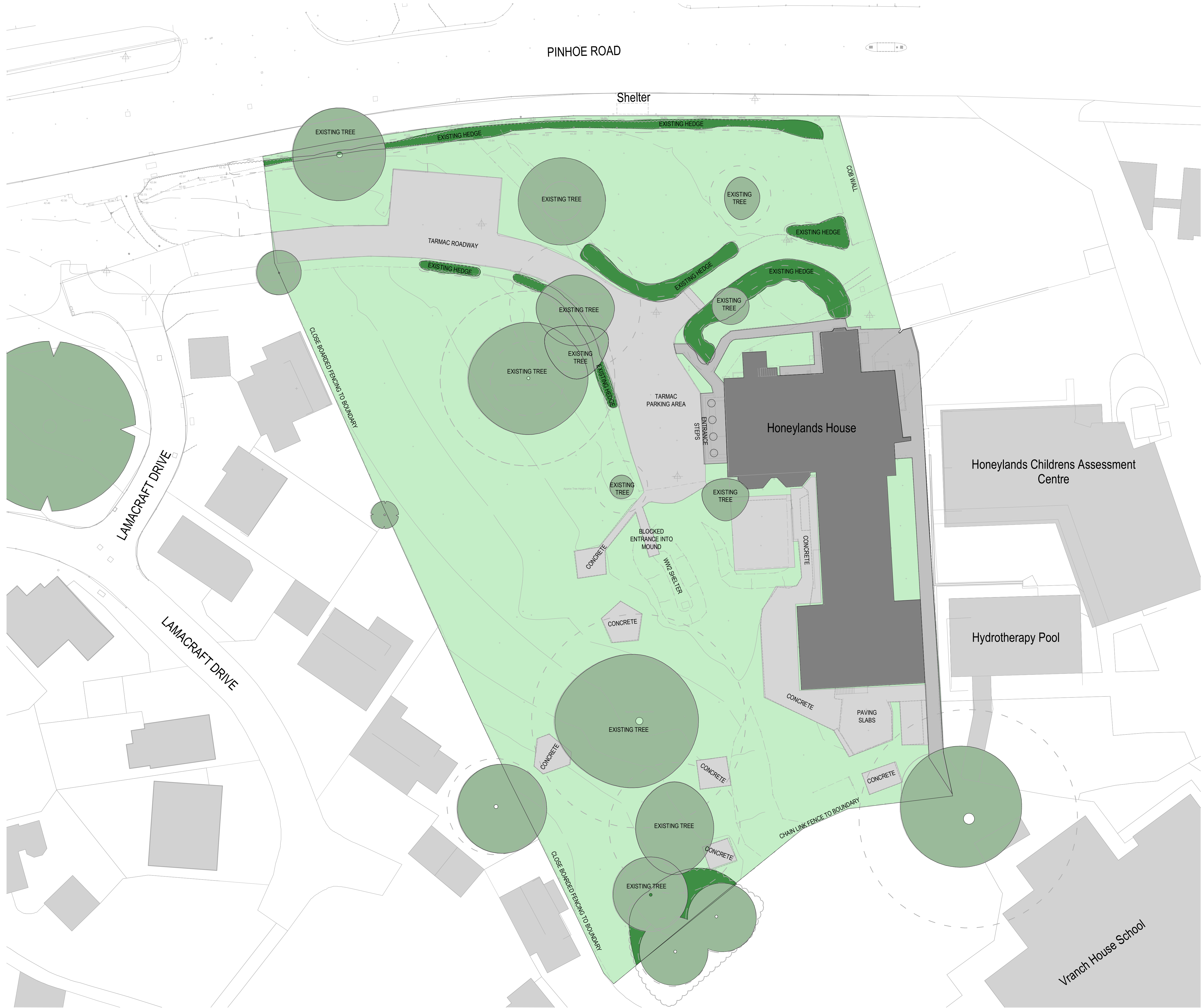
Existing Site Plan 1 : 250