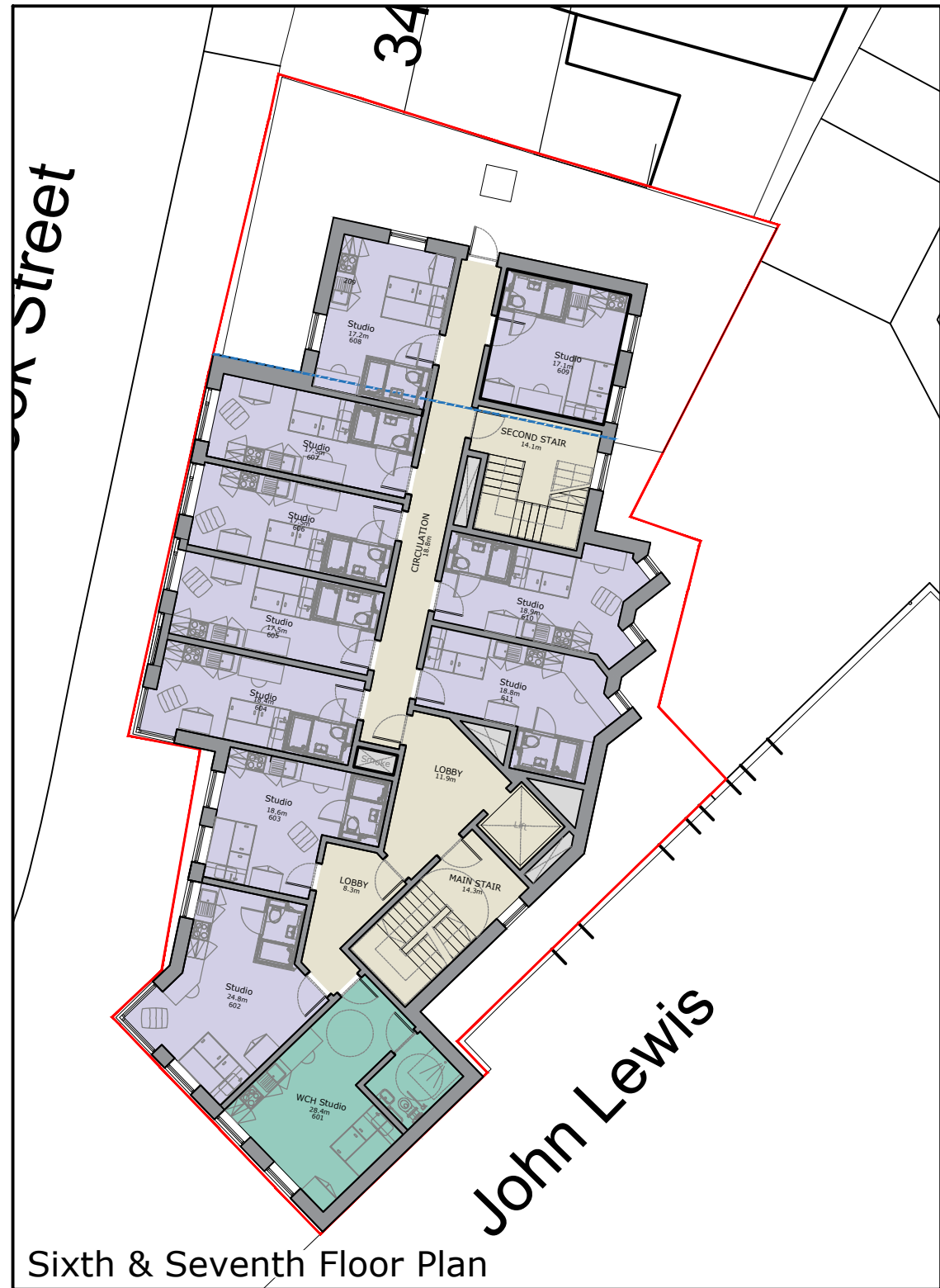
Sixth & Seventh Floor Plan