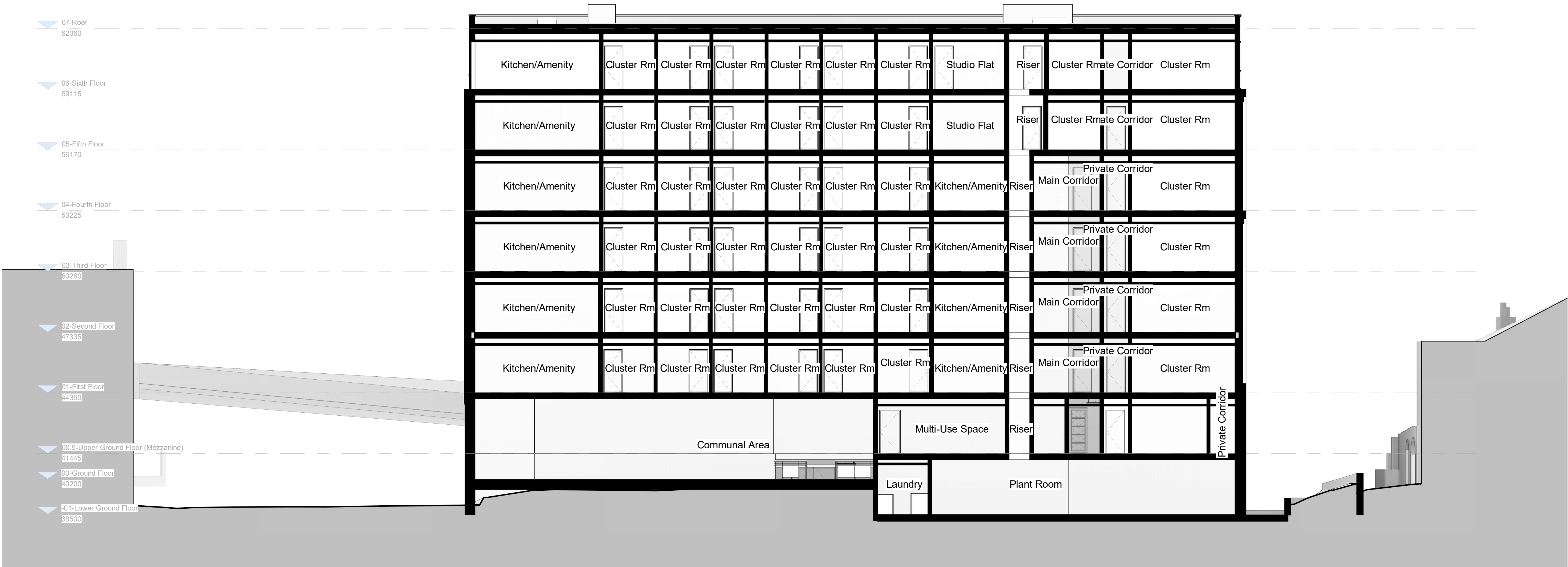
Section C-C 1 : 100