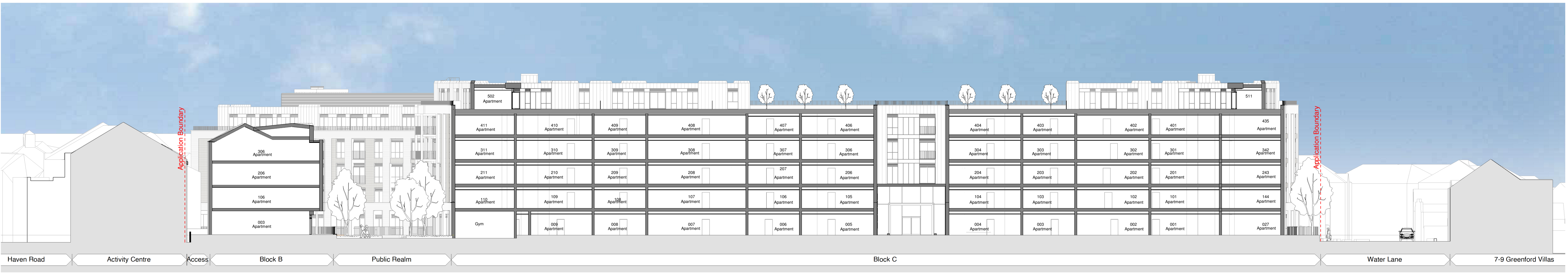
Section P9-P9 1 : 250