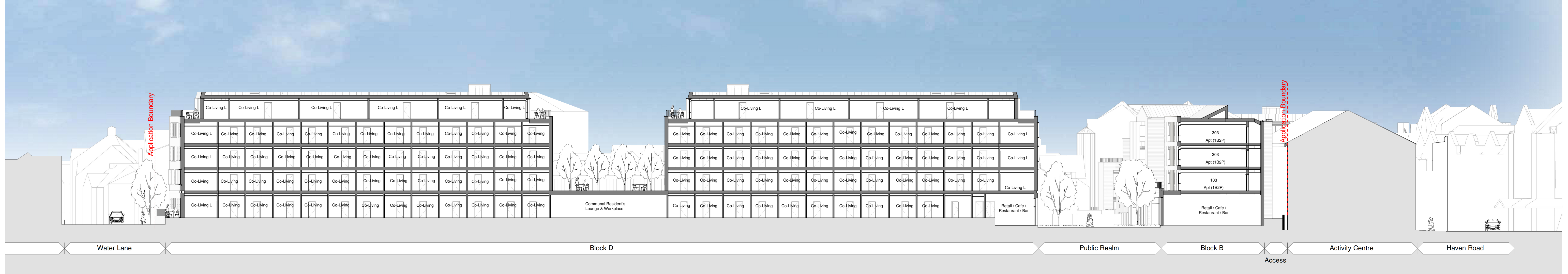
Section P8-P8 1 : 250