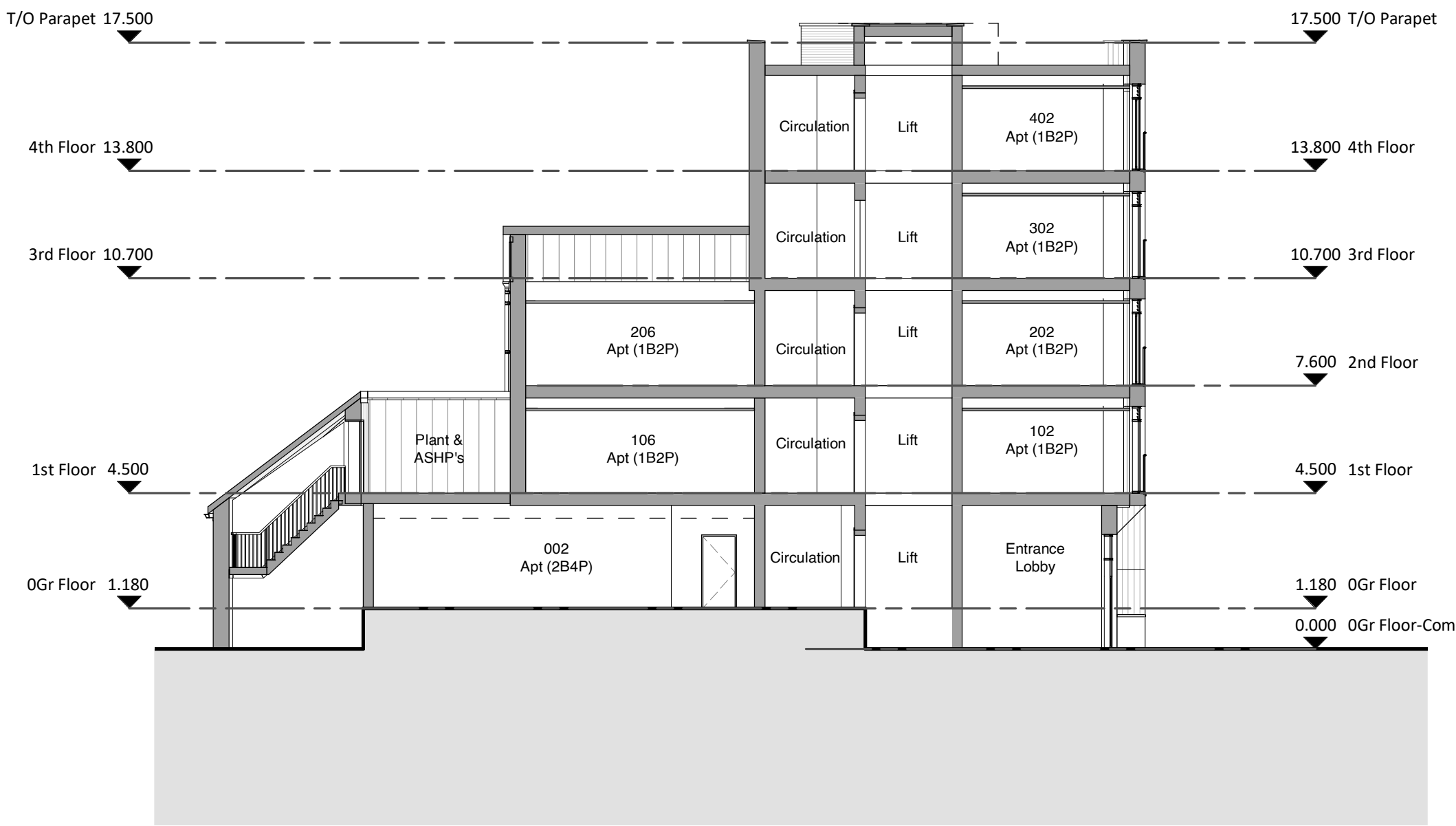
Block A - Section B-B 1 : 150