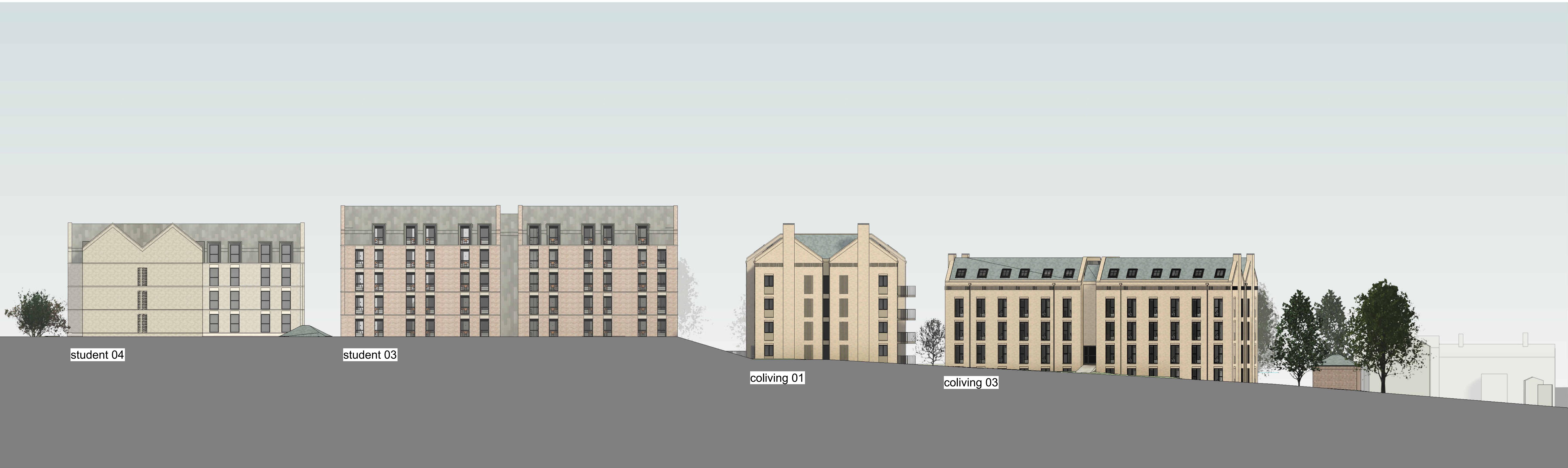
4 Proposed St Matthews Close Elevation 1 : 200