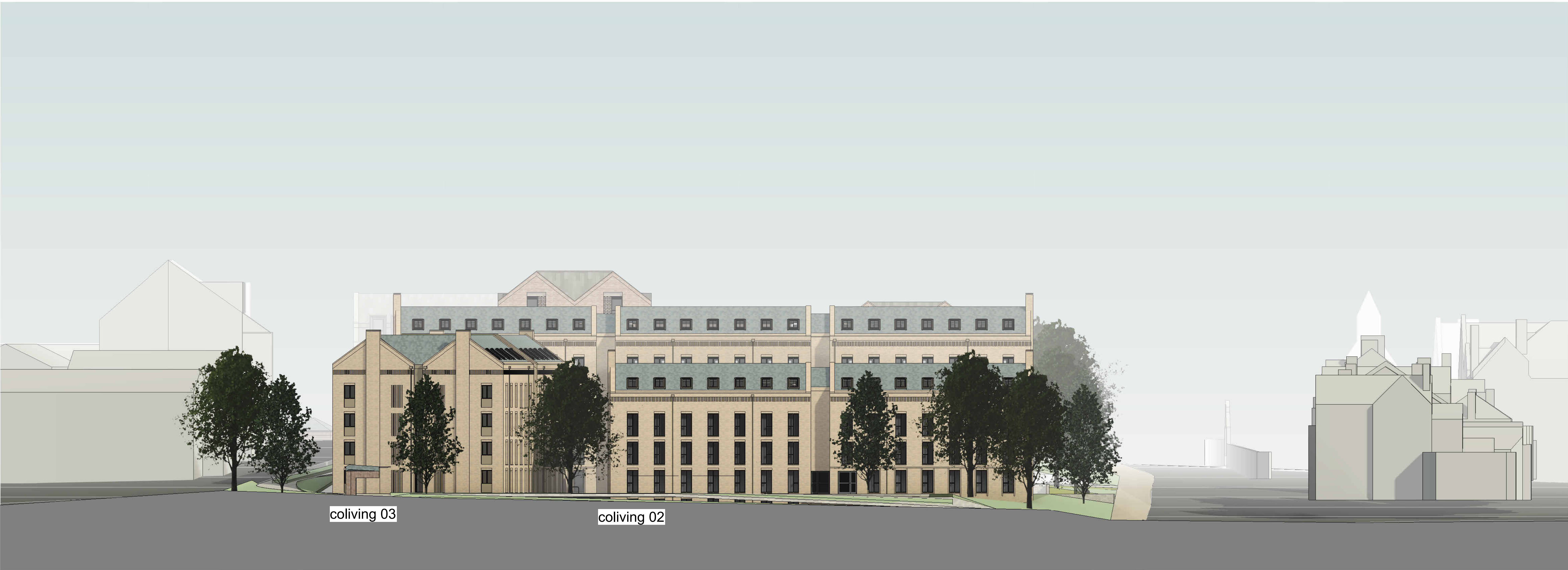
3 Proposed Higher Summerland Elevation 1 : 200