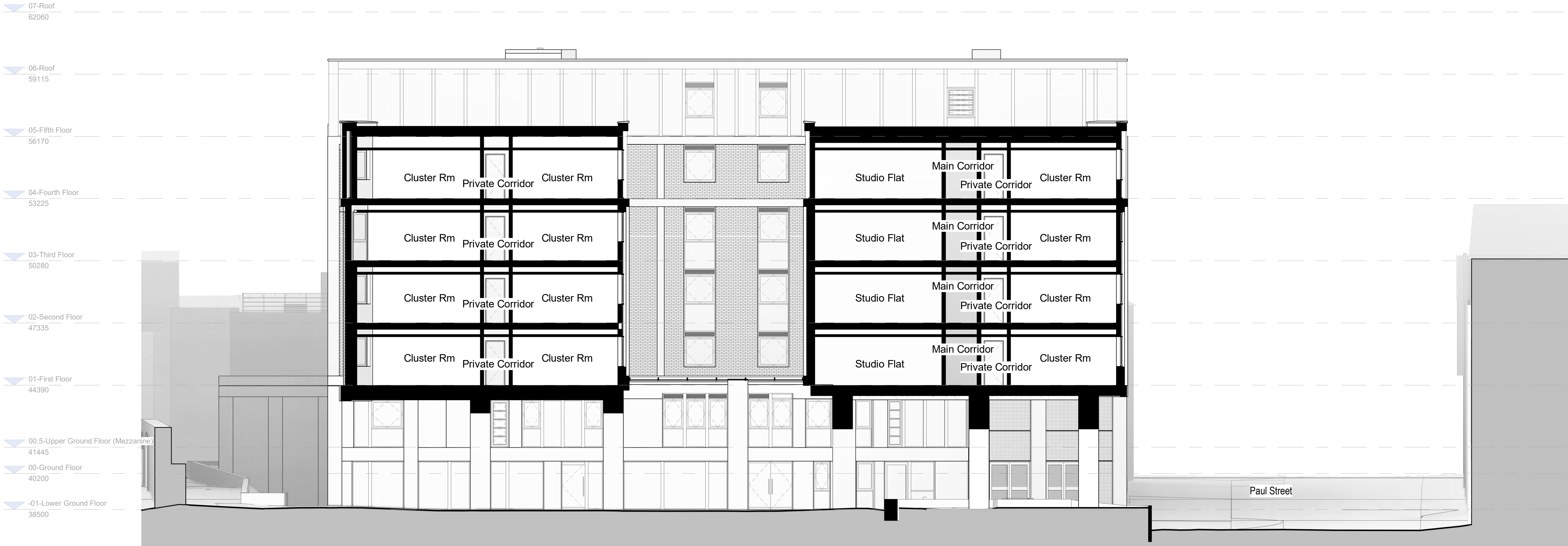
Section D-D 1 : 100