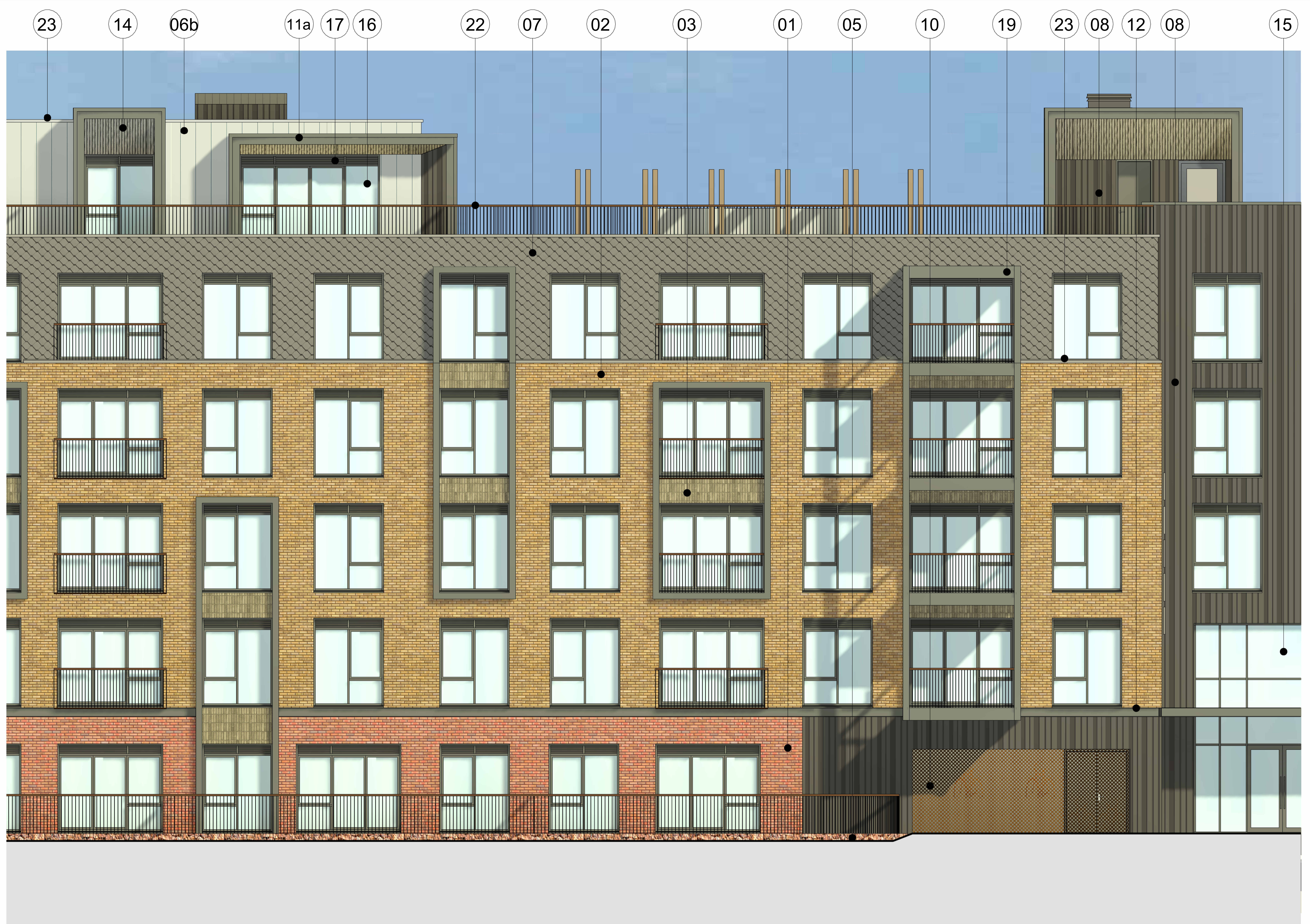
Block C - North Elevation