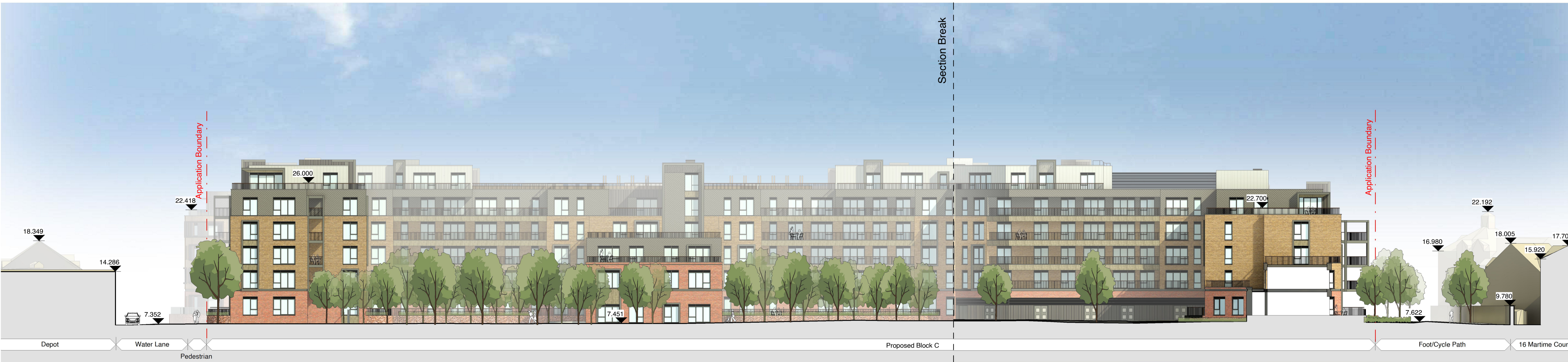
Street Elevation 4