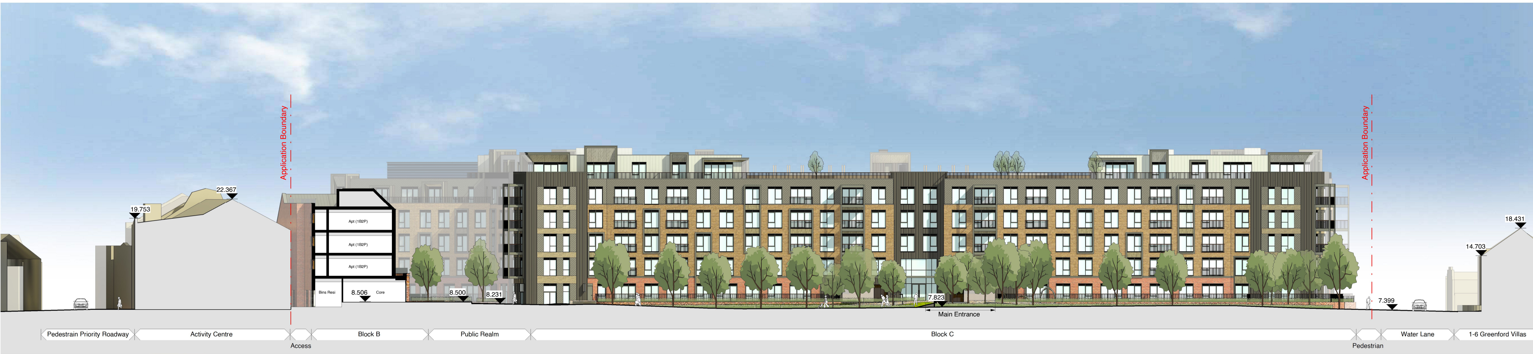
Street Elevation 3