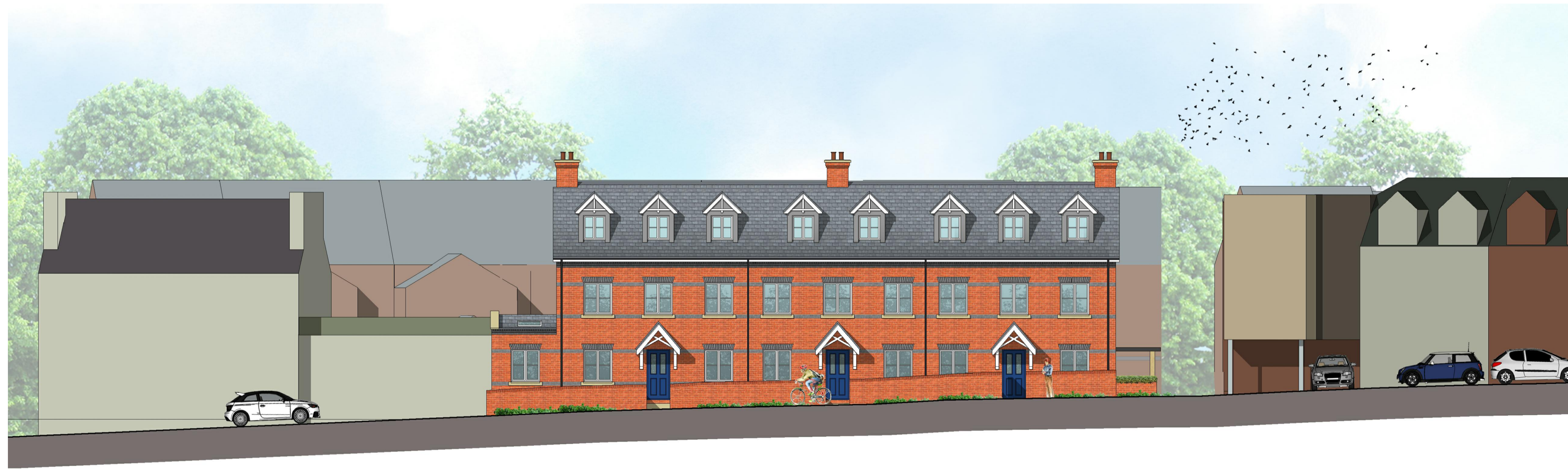
HOWELL ROAD CONTEXTUAL SECTION