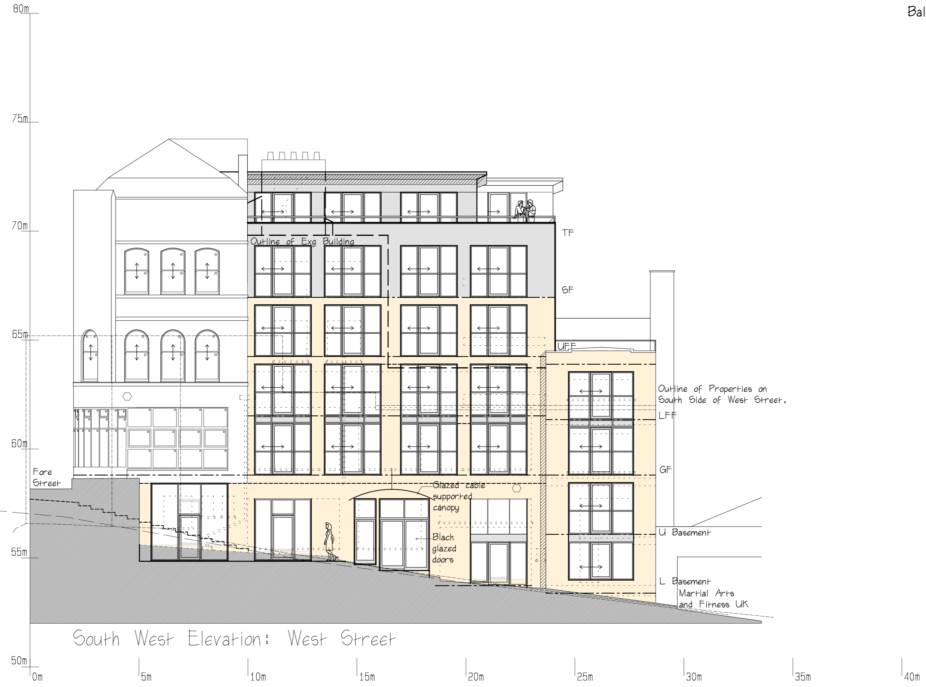
South West Elevation: West Street

Schedule of Materials: Roof: Standing Seem Zinc Walls: Render - beige/light grey Fascias/Barge: Zinc coated Steel Windows/Doors: Zinc coated Steel Balustrades: Zinc coated Steel