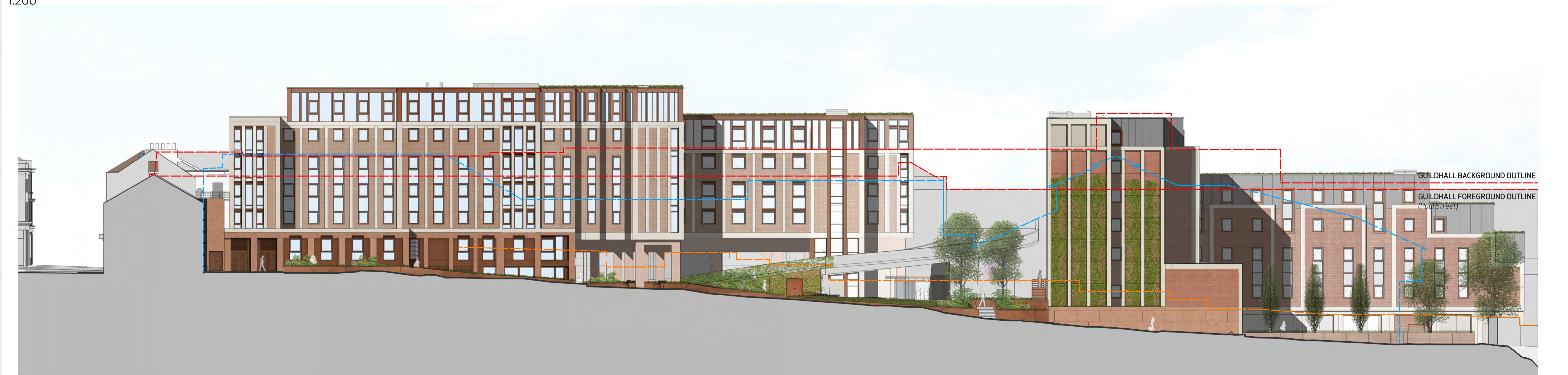
PROPOSED NORTH WEST ELEVATION 1:200