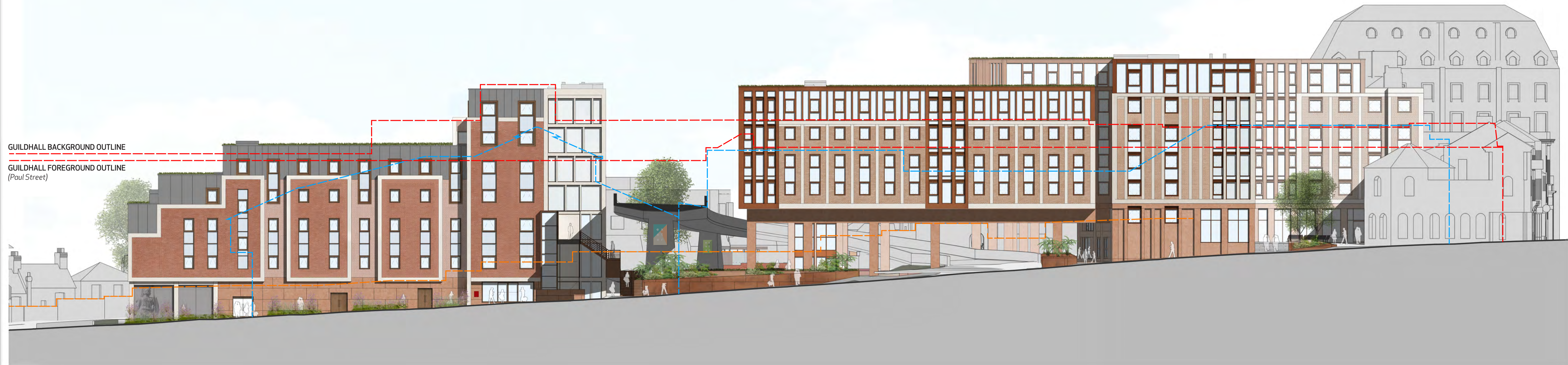
PROPOSED SOUTH EAST ELEVATION 1:200