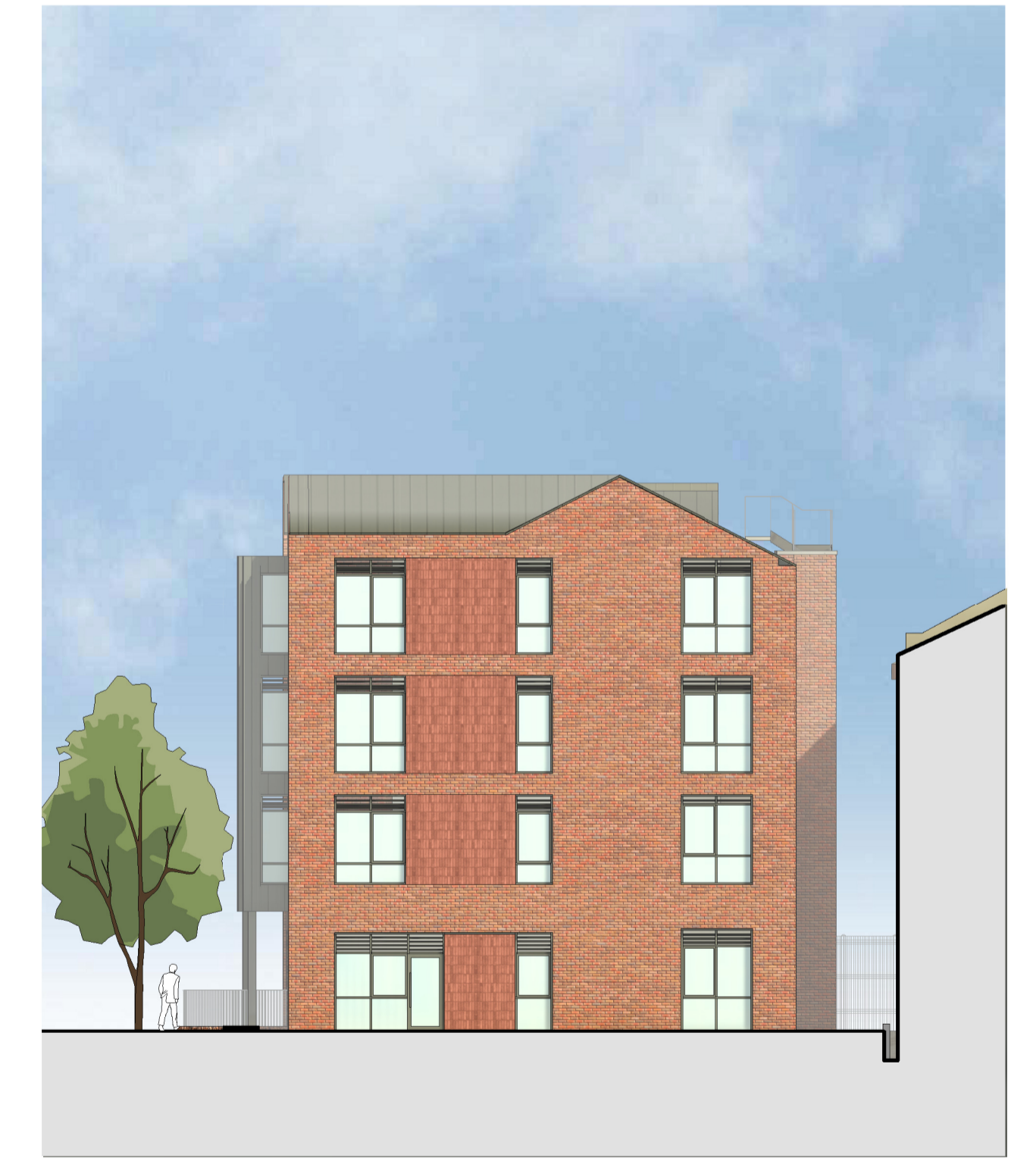
Block B - South East Elevation