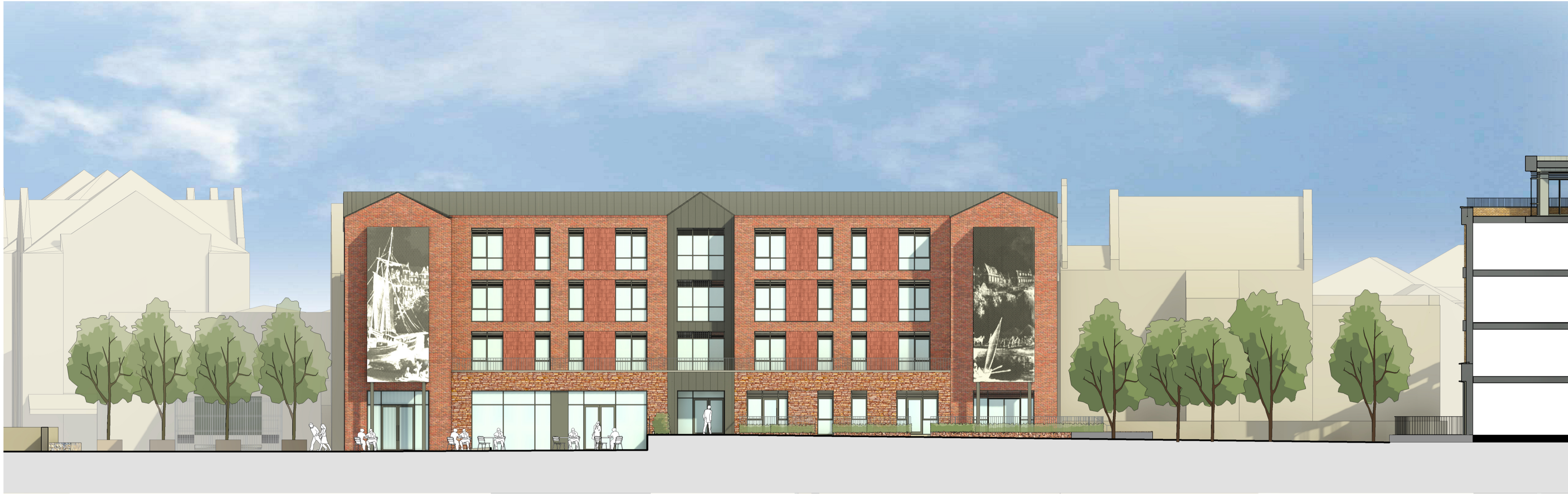
Block B - South West Elevation