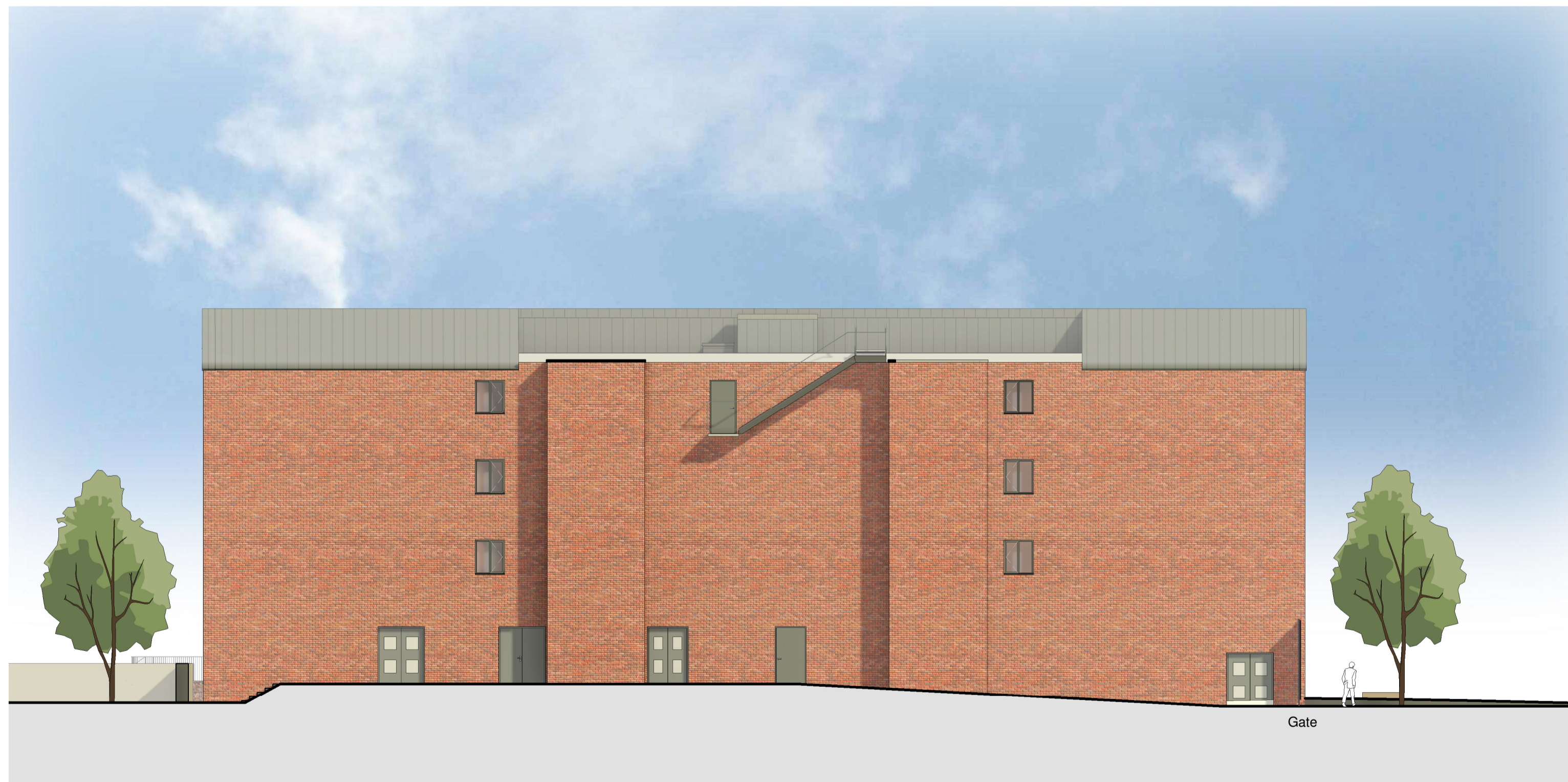
Block B - North East Elevation