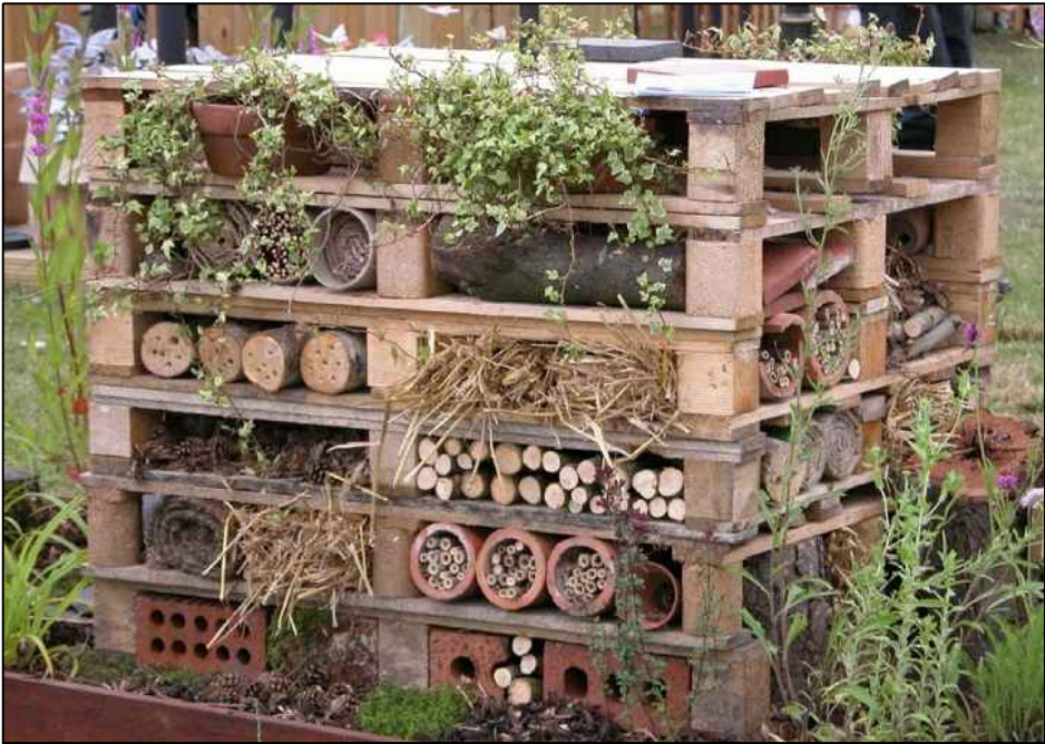
Typical 'Insect Hotel'