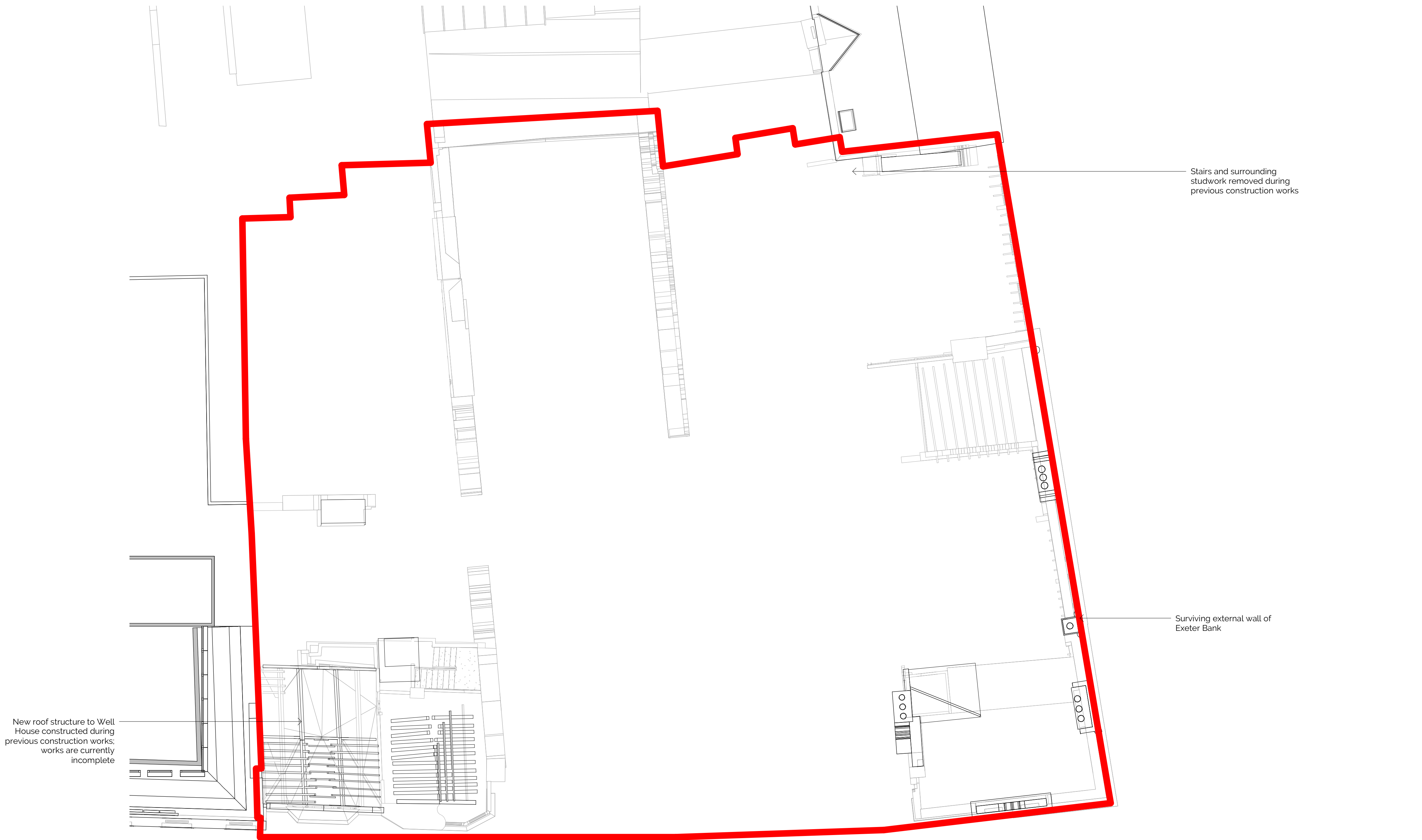
1 Survey Roof Plan - 57920 1 : 100

Plan of floor below shown as underlay for reference