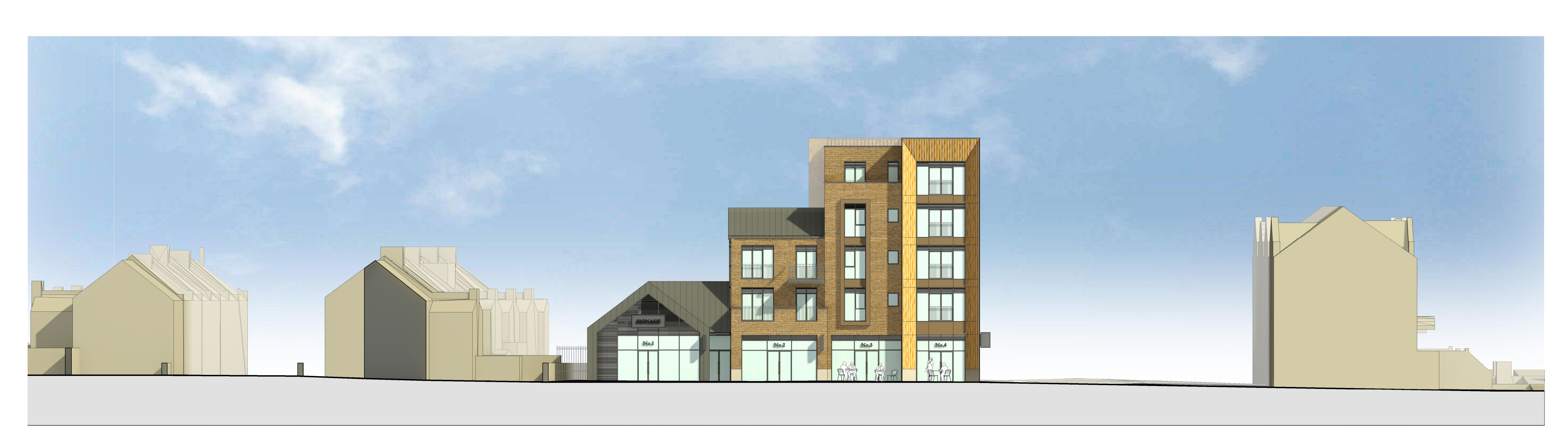
Block A - South East Elevation