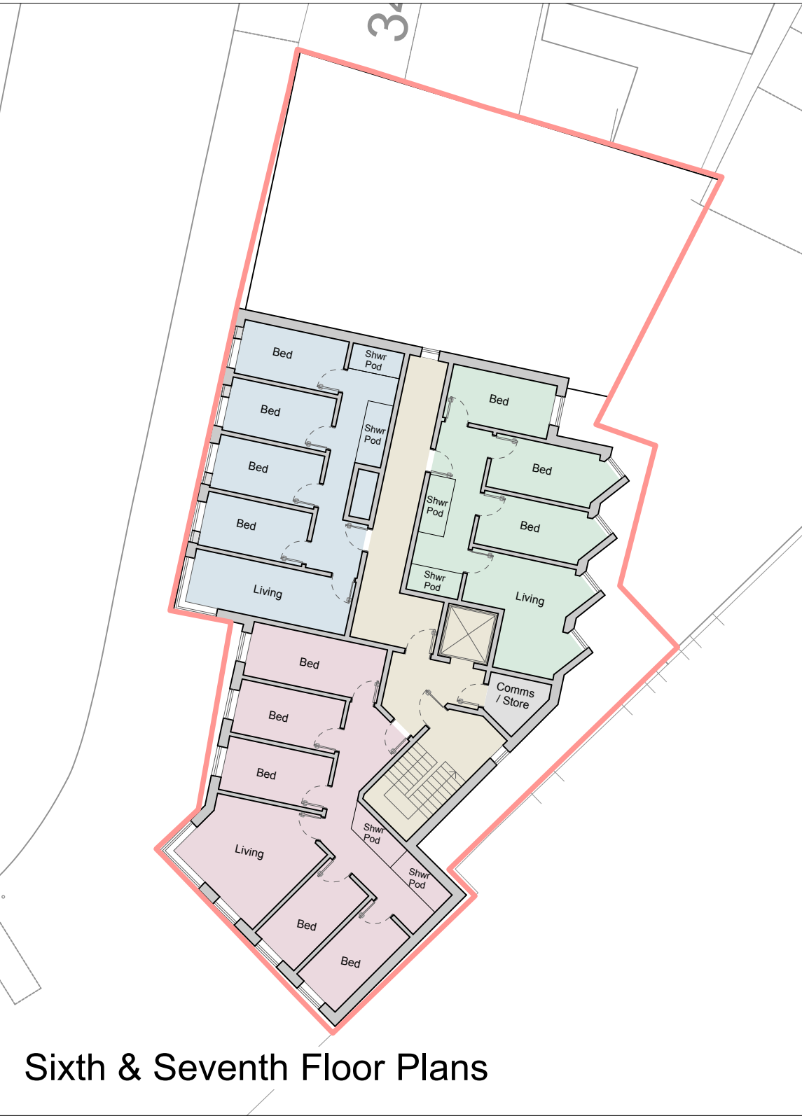
Sixth & Seventh Floor Plans