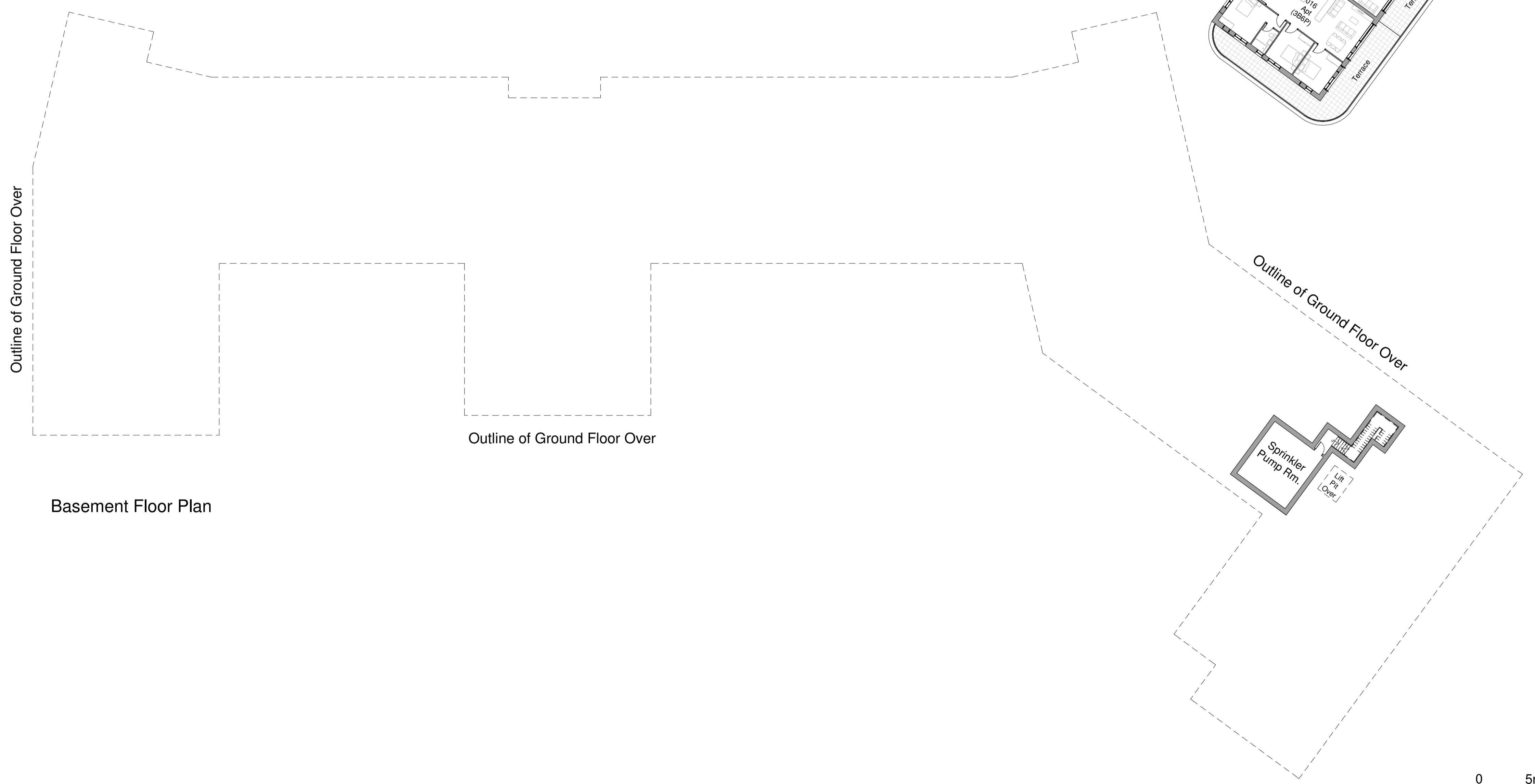
Basement Floor Plan