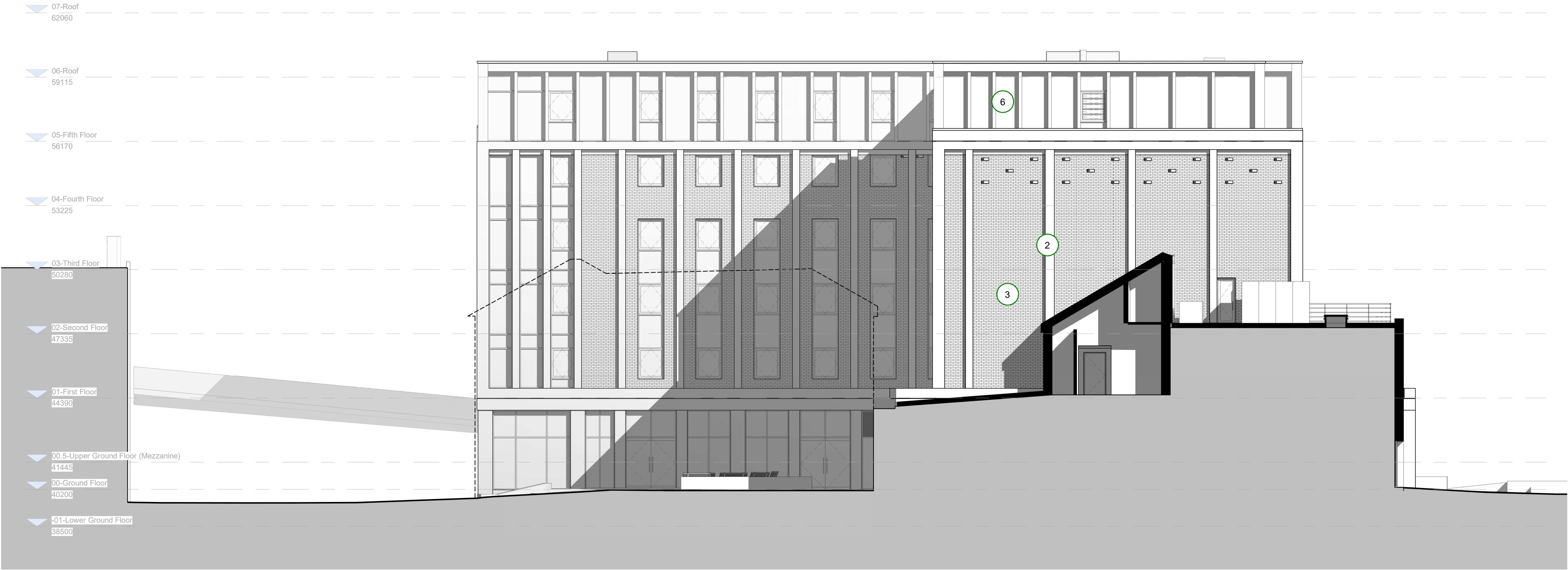
North East Elevation 1 : 100