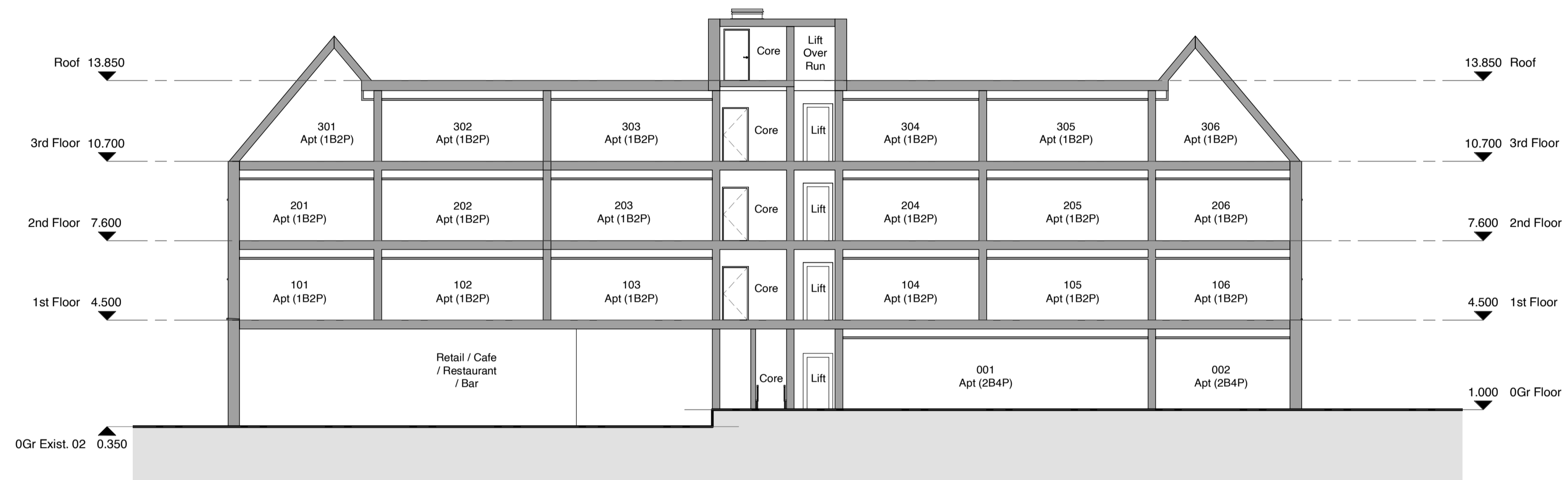
Block B - Section A-A 1 : 150