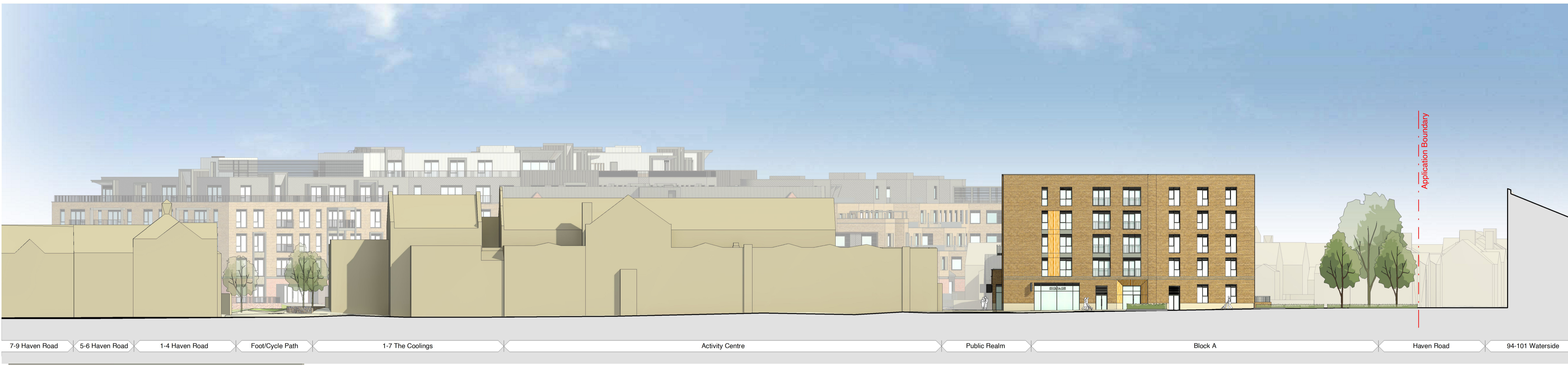
Street Elevation 8