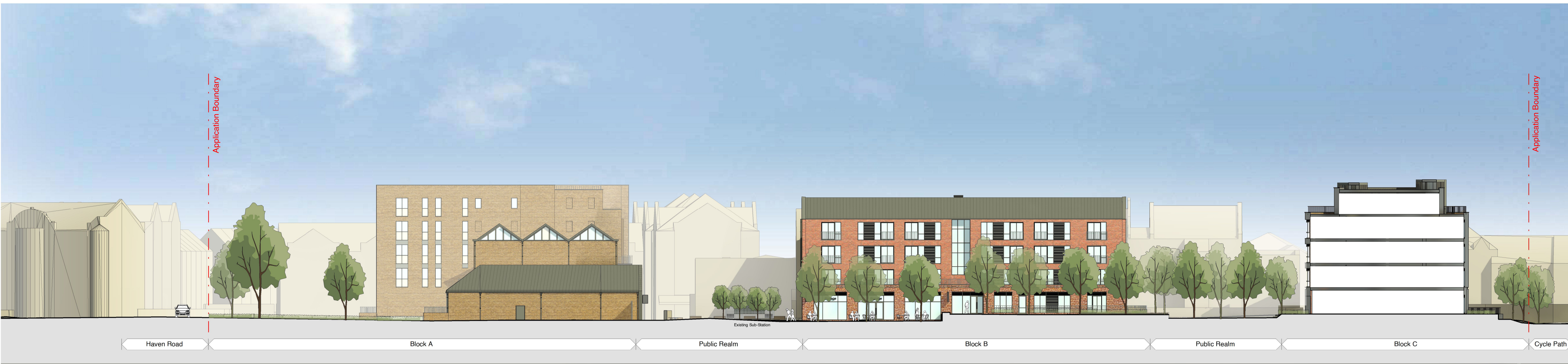
Street Elevation 7