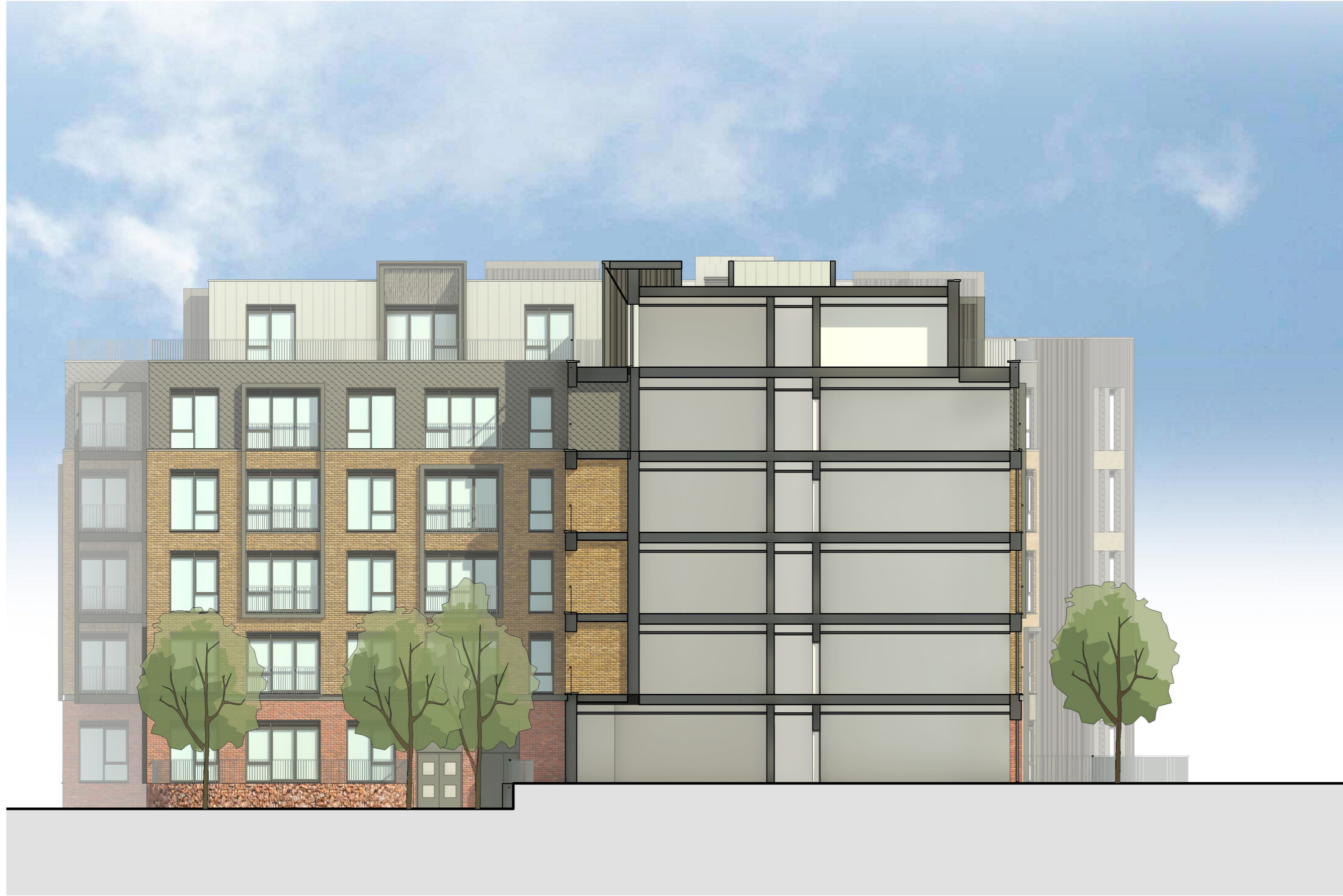
North East Elevation 3 1 : 150