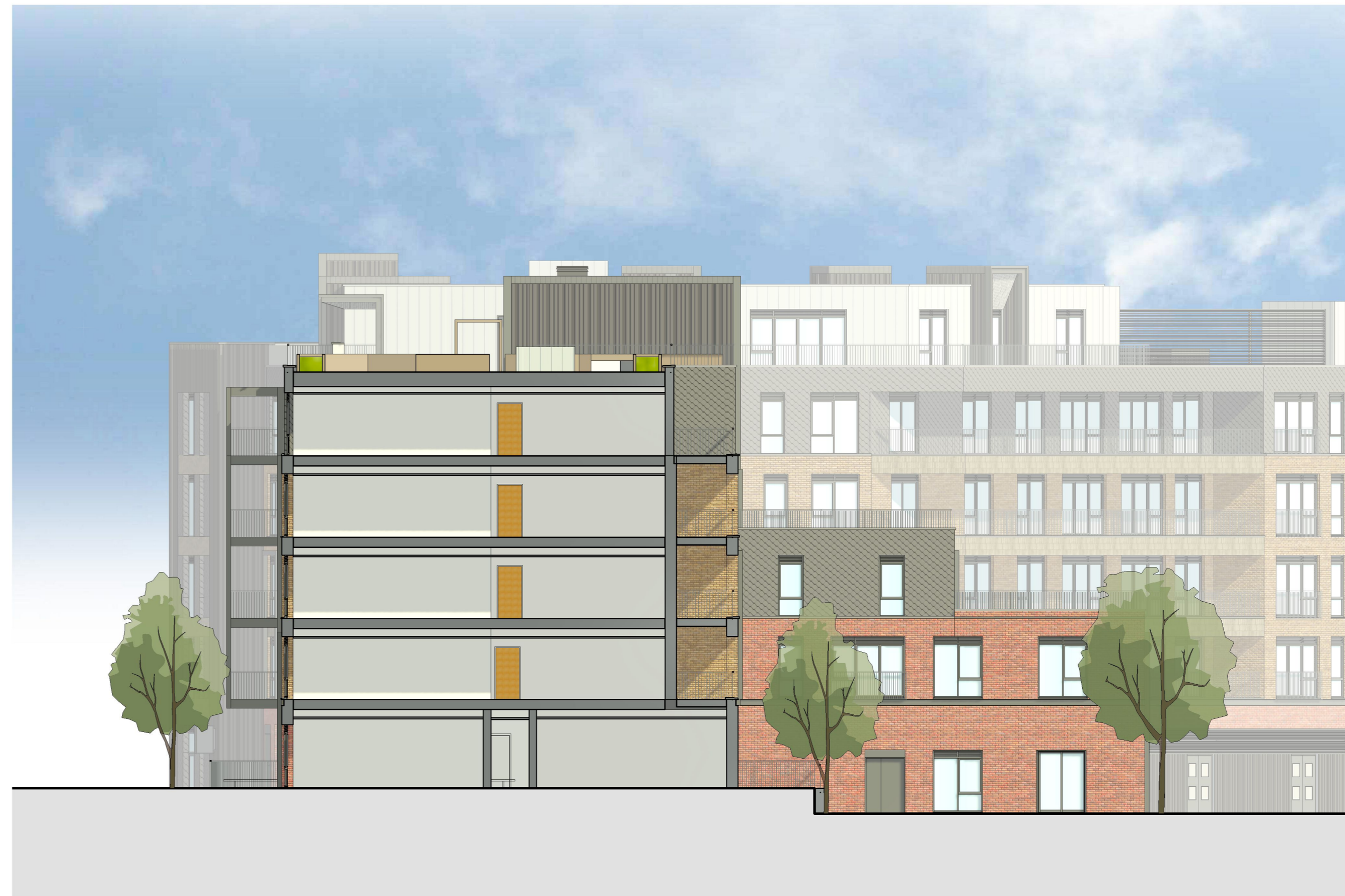
South West Elevation 2 1 : 150