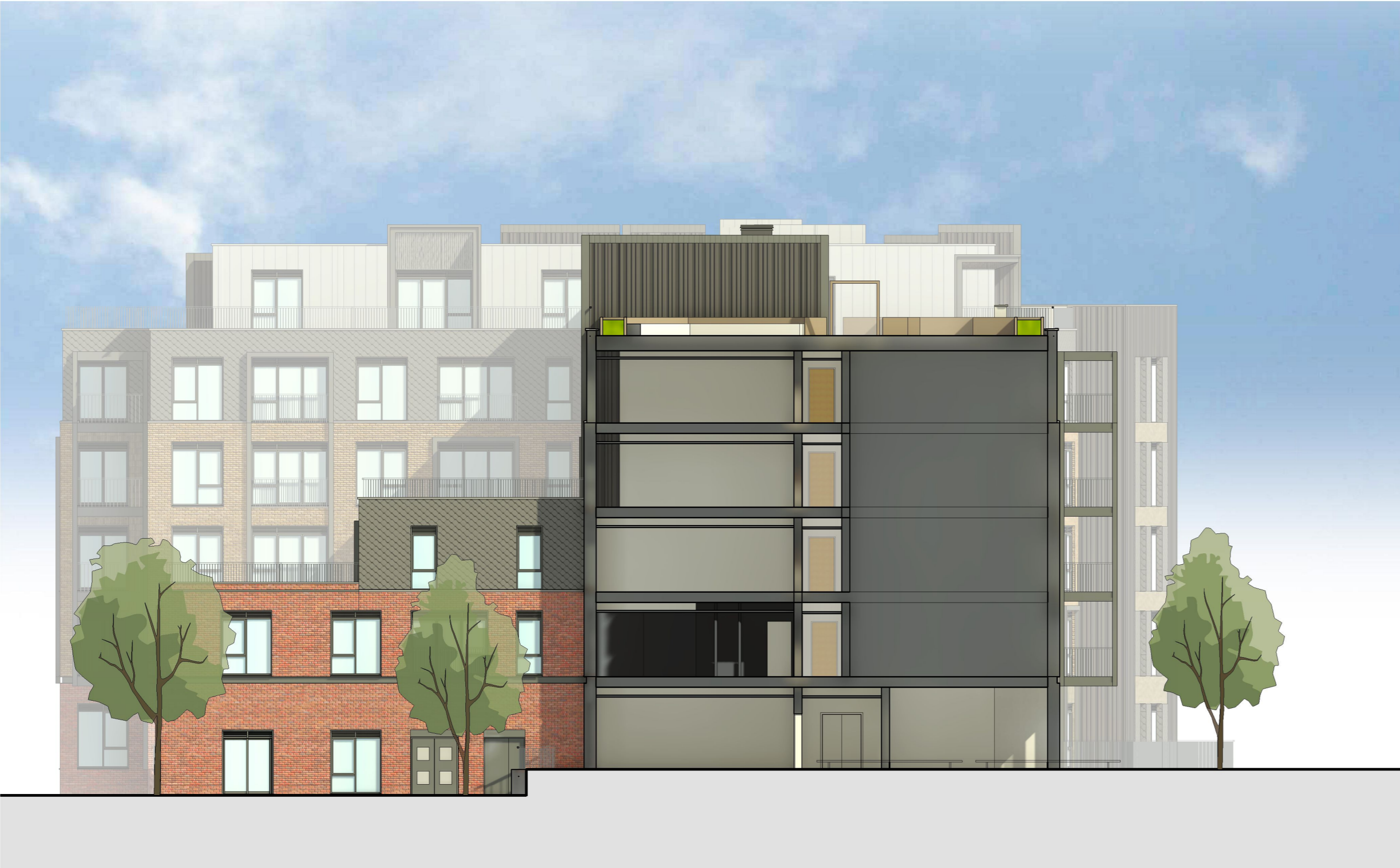
North East Elevation 2 1 : 150