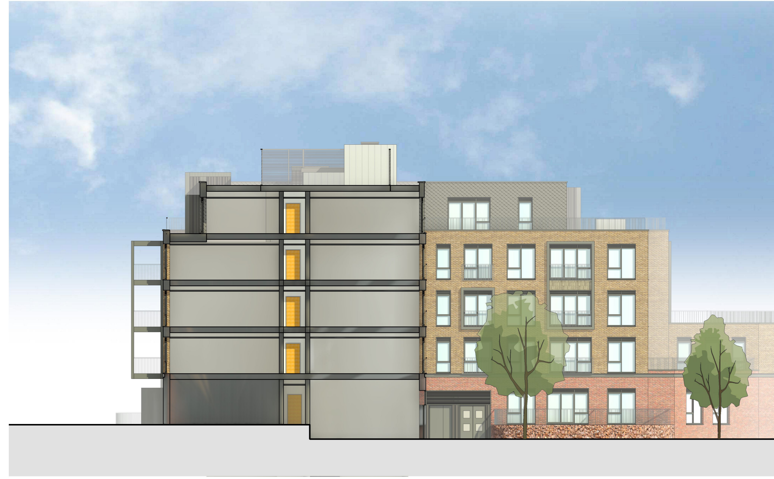
West Elevation 1 : 150