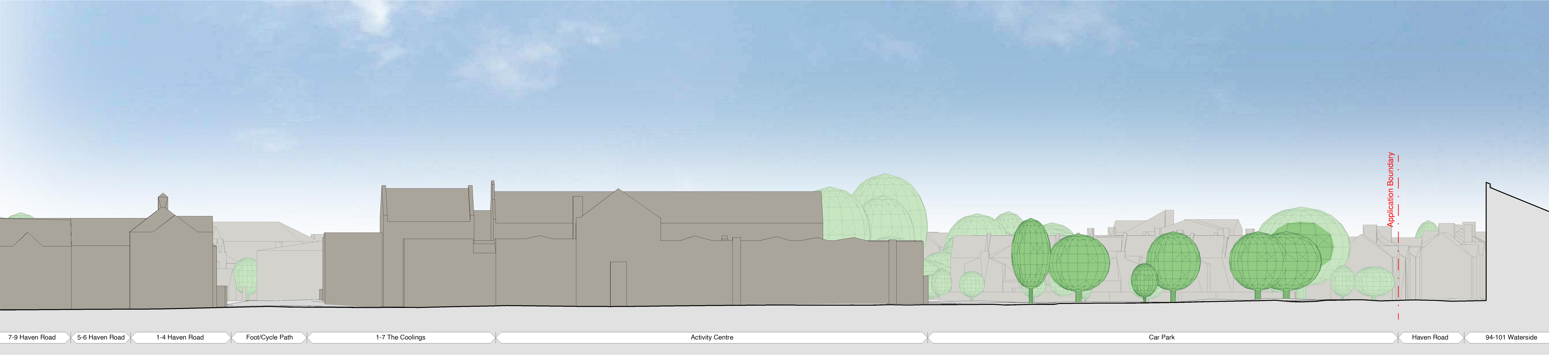
Street Elevation 8