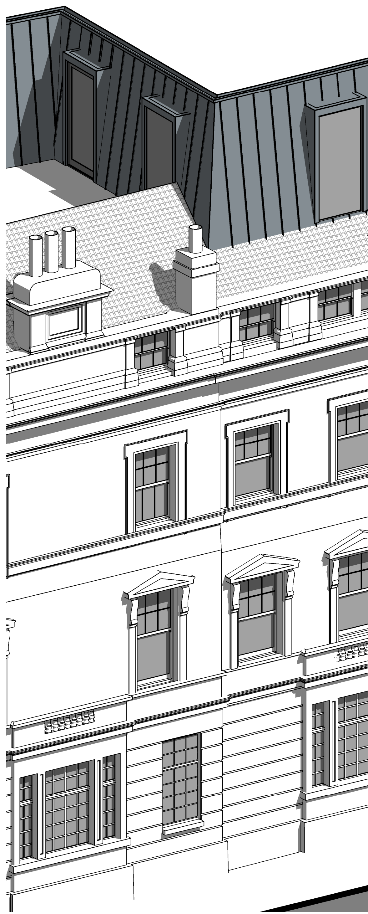
3 3D Detail 2