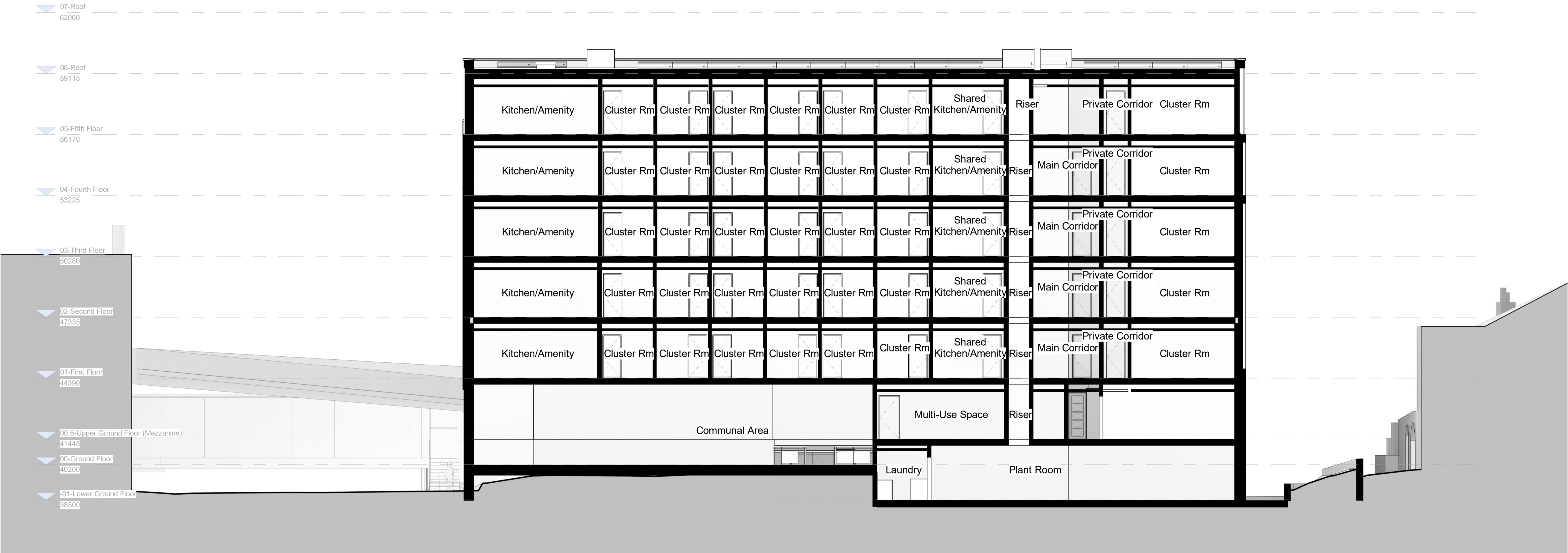
Section C-C 1 : 100