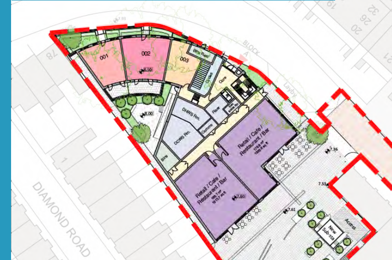
Block A configuration after consultation